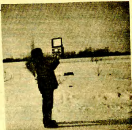
10 v/m measurement at a distance of 75 miles from the transmitter antenna site. Notice employee wearing protective boots and jacket.