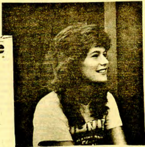
One of the many lovely Staffers at the N.R.C. SHORTWAVE STATION (Sorry no DXer's allowed onto the premises)