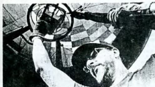
PHOTO OF NRC SWAT TEAM MEMBER PUTTING LSD INTO A CITY'S WATER SUPPLY SYSTEM.

This is my first fussing. I'm a freshman here at UNO, majoring in Hobby Sciences, with a minor in DXing. I'm hoping to graduate in 3 years instead of 4 on the basis of the 32 credits I earned for getting a QSL from the Falklands on 536 KHz. The classes are given at night to take advantage of the best propagation conditions, and we have quite a set up. The prime listening post consists of a TRF and a Bohac loop. However, the freshmen (freshpeople?) have to start with R-390's and 6,000 foot beverages every 30 degrees around the horizon. The R-390, being a portable (it has handles, doesn't it?) is used for field trips ---- we usually take two or three -- to the nearest broadcast station, so we can experience real interference. My hope is to get a job teaching DXing to pipeline workers in the north, since I consider that to be a real public service. Keeps them off the bottle, you know. Although many hear about the B. antenna and sing up in error. 73's.