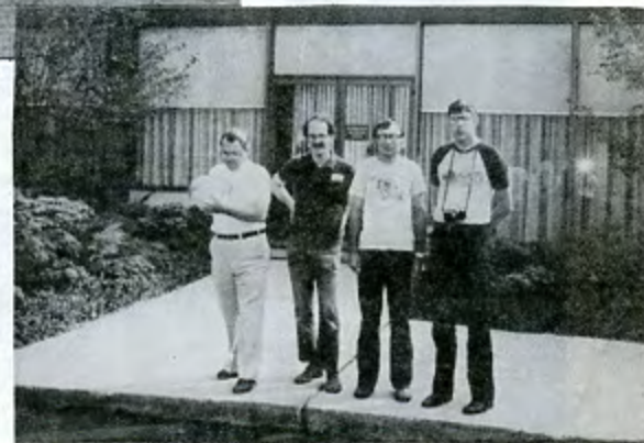
N.R.C. SWAT TEAM