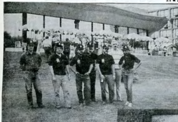
MEMBERS GATHERING AT THE 1983 NRC CONVENTION IN CT.