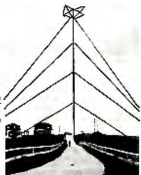
This is the 420-foot steel tower at Blackman's Point, erected in 1905 and over which the world's first radio program was broadcast the next year. It was demolished in 1913.

In Beant Rock by mid-summer work had progressed to the degree that the bare essentials at Western Tower (as it was named by Fessenden and his crew) were in place. The antennas used in both Beant Rock and at Natchitoches consisted of a cylindrical steel tube 420 feet high. Each tower rested on a ball and socket, which in turn was installed on an insulated base. In order that it would bear the stress of wind, it was supported by sectionally placed wire-rope guys which were to set in ropes of four each at 100-foot intervals.