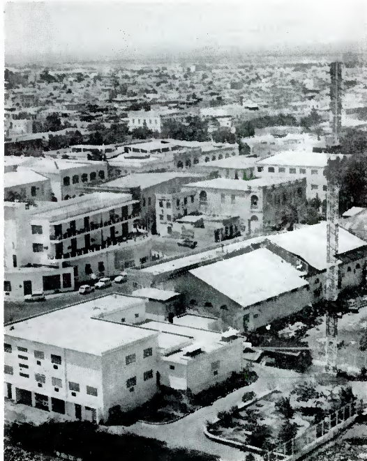
ORTF - DJIBOUTI, AFARS AND ISSAS. PHOTO TAKEN BY THE NATIONAL ARMY'S HELICOPTER SERVICE.

A number of rare QSLs again this month. Of particular interest note those arrowed ( ).