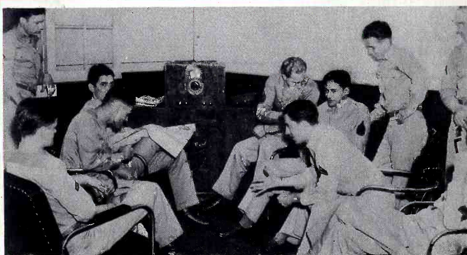
Men of the U.S. Army Signal Corps, "Somewhere in Iceland," listening in their day room to a rebroadcast of a football game from home.

COMPLETE GUIDE-BOOK FOR SHORT-WAVE LISTENERS