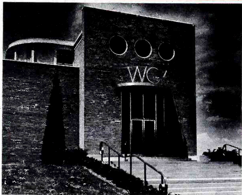
Entrance to General Electric's Ultra-Modern New Building at Schenectady, New York, Housing WGY's Studios.