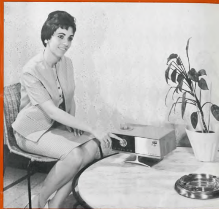
Philco's new portable negative ion generator which relieves distress caused by airborne allergies.

In addition, Philco offers a 90-day guarantee covering all parts and free carry-in service through nearly 5000 independent dealer members of Philco Factory Supervised Service.