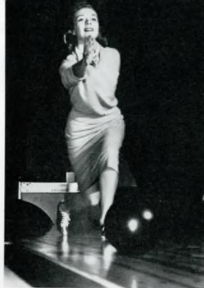
Millions of women agree that bowling is a healthful exercise.