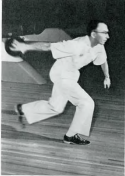
Today more than twenty million people find bowling healthful and relaxing.