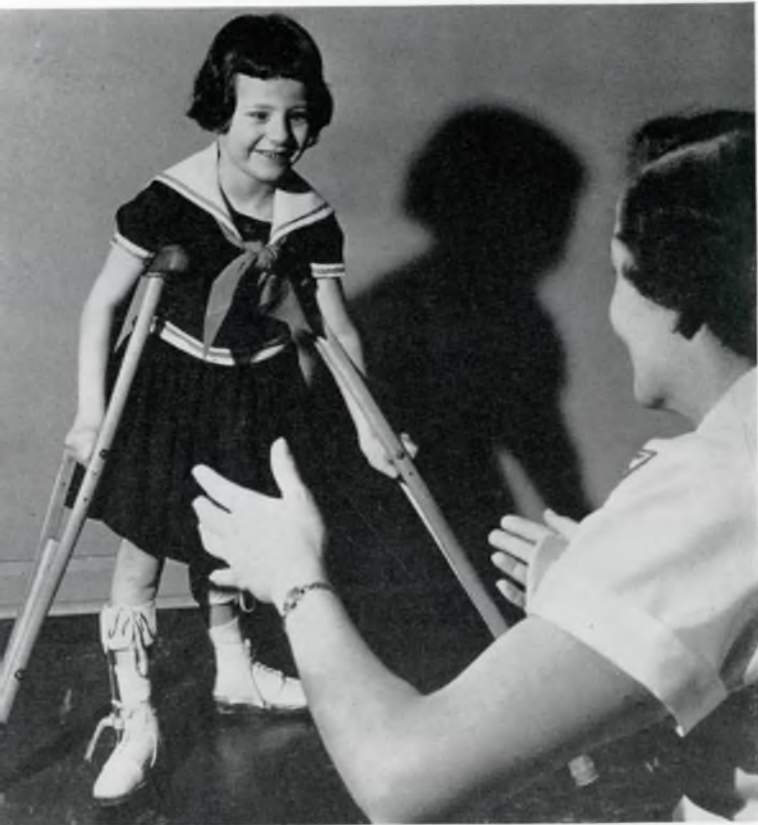
The first step—and a whole new world is opened to her. Cerebral palsy hasn't been licked yet but thanks to your United Fund gift, research, treatment and determination are triumphing over muscles that won't respond because the "control center" has been damaged.

Loving care for children of broken homes is only part of the Salvation Army's 54 services which include fresh air camps, day nurseries, community centers and rehabilitation services. Your whole-hearted support of the United Fund makes it possible for the Salvation Army to continue extending "Heart to God and hand to man."