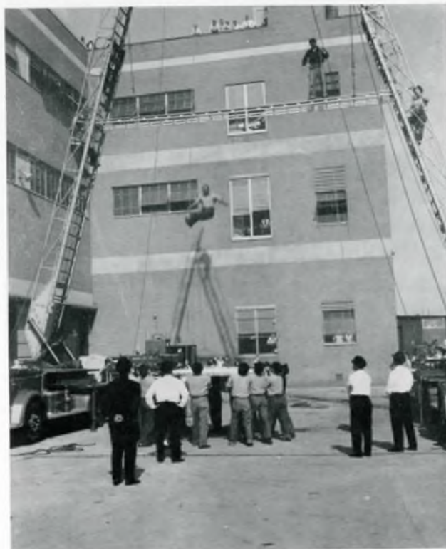
THE CORRECT WAY to jump into a fire net is shown by members of the Philadelphia Fire Department.

It was just about 500 years ago this year that Johann Gutenberg started work on the first complete edition of the Bible to be printed from movable type. The job took him five years. It was the "best seller" in the 15th Century, just as it is in the 20th, even though it "competes" with approximately 7,500 new books every year in America.