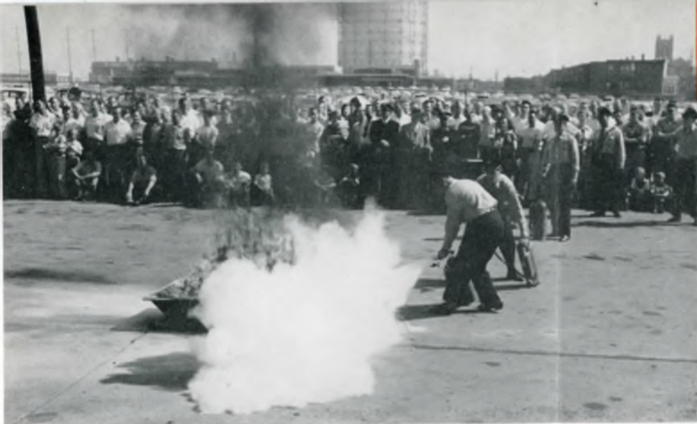
◀ A GASOLINE FIRE is extinguished by means of chemicals in a matter of seconds. All phases of fire fighting were covered by members of the Philadelphia Fire Department during their visit to Philco as part of the observance of National Fire Prevention Week.