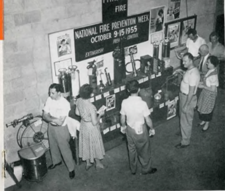
A TYPICAL EXHIBITION of fire-fighting equipment used by Philco is examined by a group of employees in Plant 10. The exhibition was in place throughout National Fire Prevention Week.

of the Nation's ablest directors who has helped make the safety record at Philco an outstanding one."