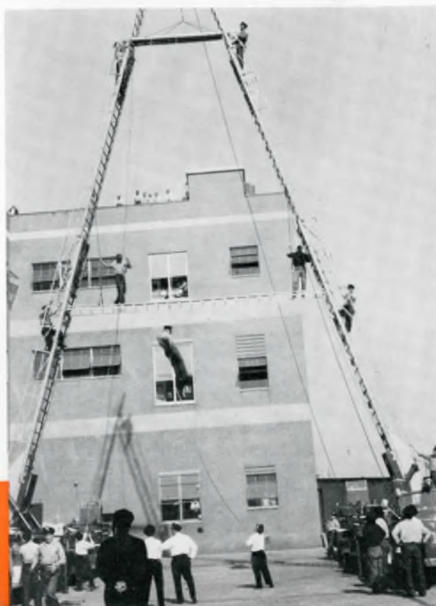
PROPER METHODS of rope sliding are shown by members of the Philadelphia Fire Department.