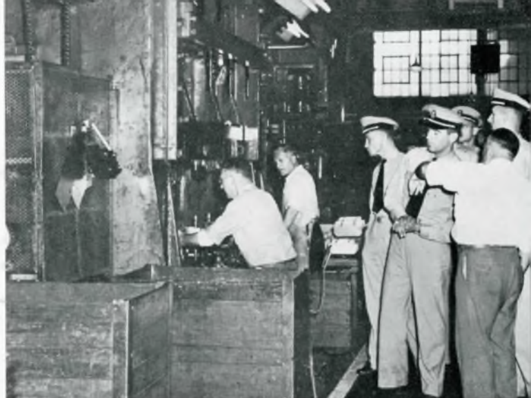
▲ FIRST ON THE TOUR of inspection for the midshipmen are the punch presses in Plant 6.