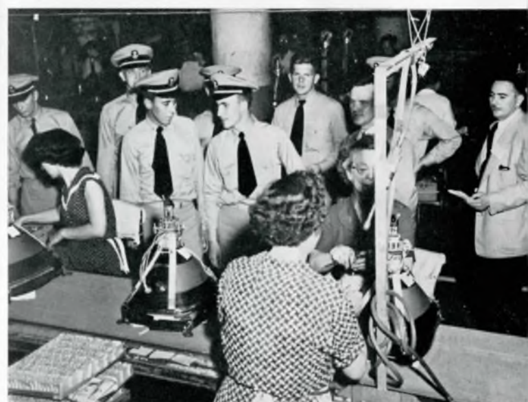
▲ CONSIDERABLE INTEREST is shown by the visitors in the CR Tube Assembly operations.