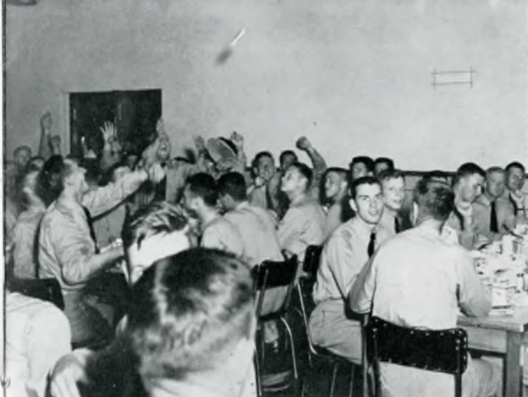
▲ PACKAGES OF CIGARETTES are tossed to the visitors following luncheon in Plant 6 Cafeteria.