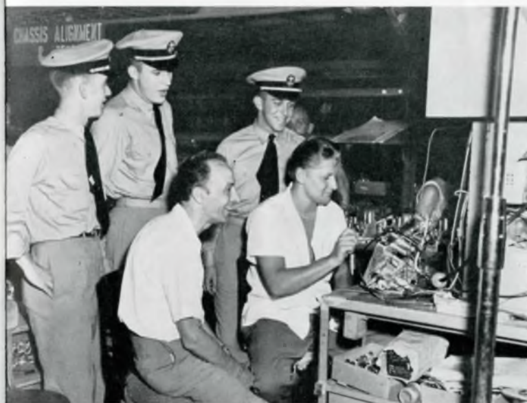
▲ CHASSIS ALIGNMENT and tests are attention holders in Plant 3.