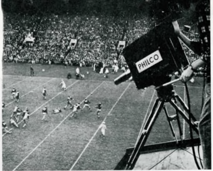
▲ WPTZ will increase its college football coverage this year.