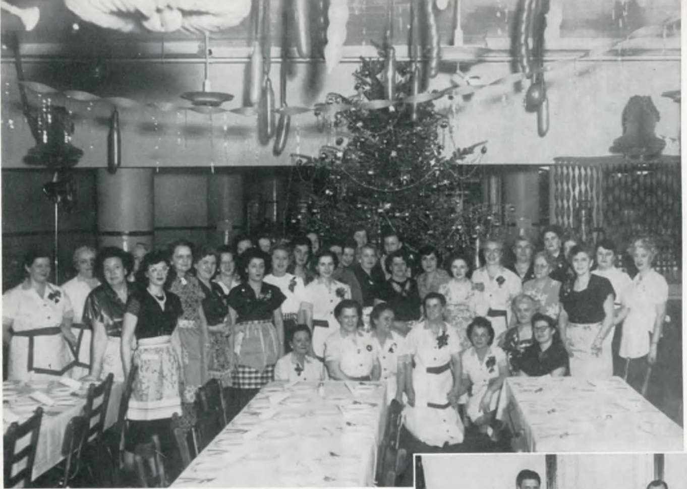
▲ MEMBERS OF THE SERVING COMMITTEE, who doubled as hostesses, line up around the Christmas tree prior to the arrival of the guests. A few minutes later the scene was quite different, with more than 500 children to be waited on and watched over with loving care.