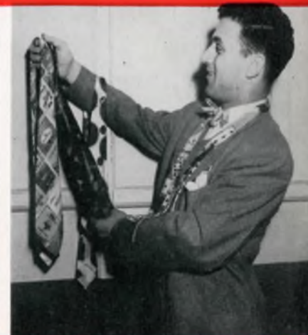
"NO MORE over-bright ties for me (when I've worn out my Christmas gifts)."