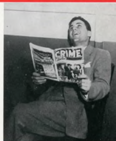
"I'LL DRINK nothing stronger than water (unless I can get tea)."