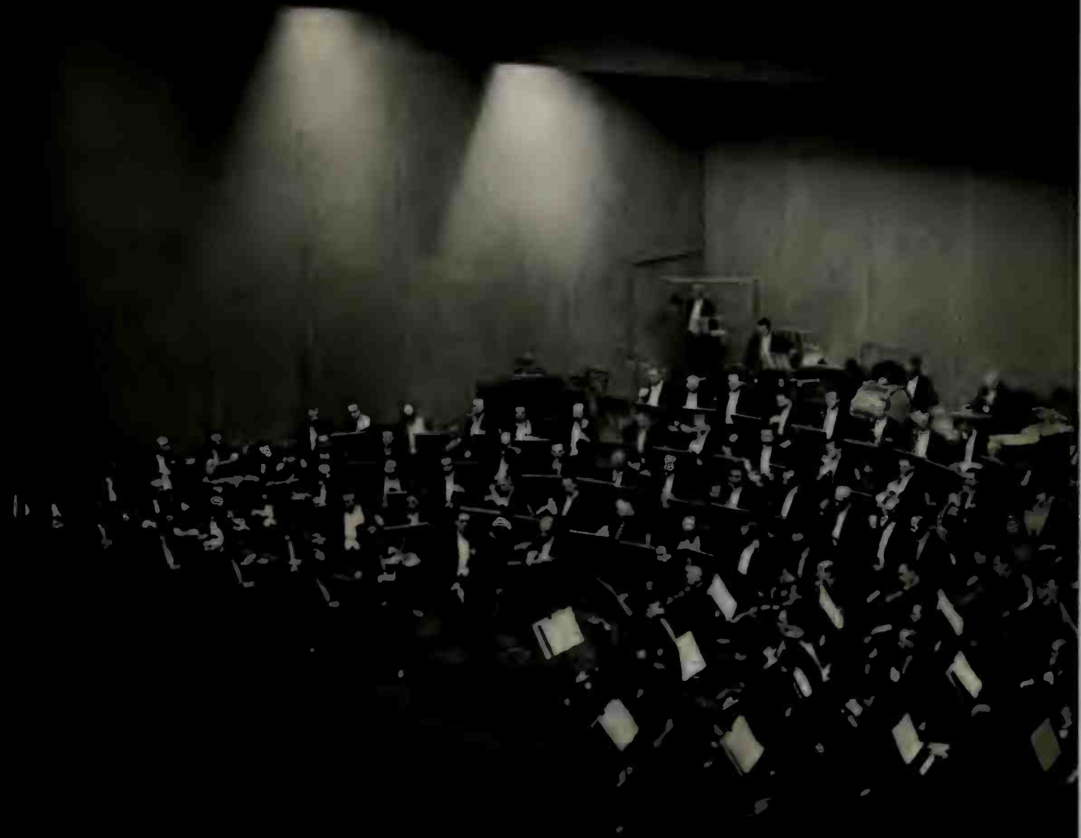
The Philadelphia Orchestra