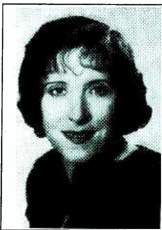
GRACIE ALLEN "Adventures of Gracie"—CBS