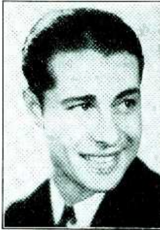
DON AMECHE "First Nighter"—NBC