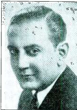
GUY LOMBARDO KPO—7:30 P. M.