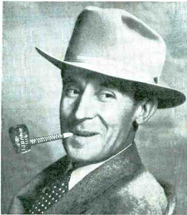
Chic Sale, one of America's foremost humorists. Appearing on the Shell Show over NBC every Monday night at 9 P. M.