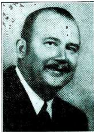
PAUL WHITEMAN NBC—7 P. M.