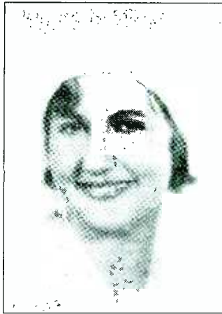
JEAN KENT KTAB—1:30 P. M.