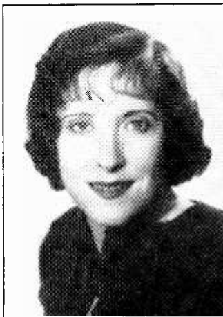
GRACIE ALLEN CBS—6:30 P. M.