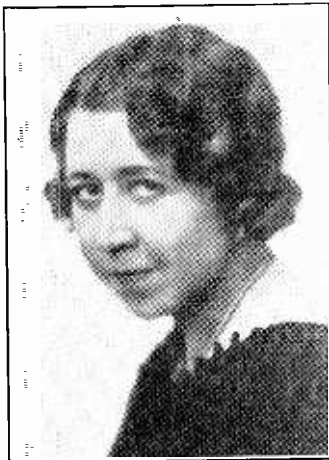
VERNA FELTON NBC—DRAMATIC ARTIST