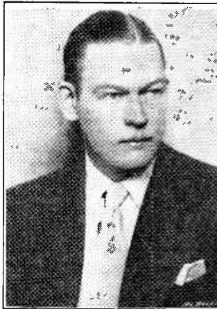
FRED ALLEN KGO—8 P. M.