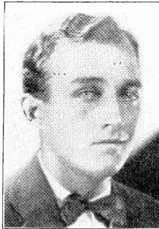
BING CROSBY CBS—8 P.M.