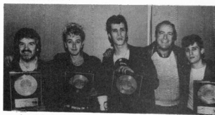
Capitol President Dave Evens presents gold and double platinum to Stray Cats for their single Rock This Town and at a later presentation, double platinum for their Built For Speed album.