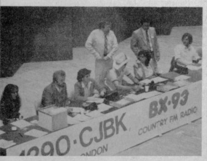
London's CJBK and BX93 gives a helping hand to area's unemployed through their Job-a-thon project, which created much interest with potential employers looking for employees.