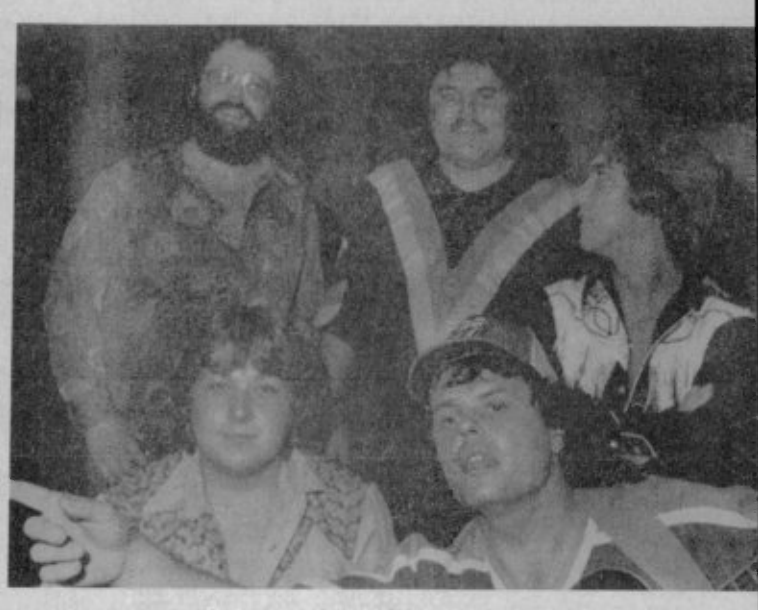
Damon's Showdown soaked up a little of the higher learning during their York University (Toronto) date, part of their extensive swing through colleges and clubs in Canada and the U.S.