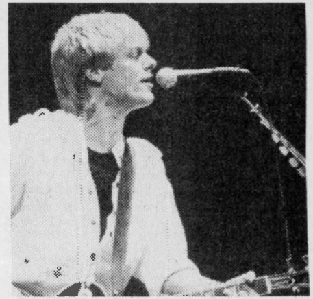
A&M recording artist Bryan Adams opened for Loverboy on their recent tour and one of the dates was his hometown of Kingston, Ontario (he now lives in Vancouver). The hometown crowd turned out in force to catch Adams in action. He is currently making good gains with his single, Fits Ya Good, taken from his album, You Want It, You Got It.