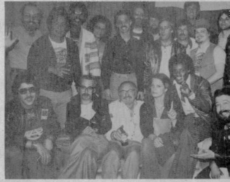
CBS staffers and CBS group Tower Of Power gather for a group shot after recent Toronto Maple Leaf Gardens date.