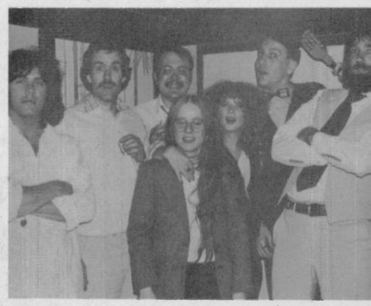
CBS group Cheap Trick meet with Toronto retailers at special dinner at the Prince Hotel, hosted by CBS Records.