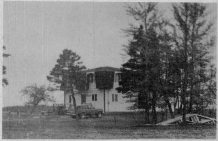
The Wayne King Festival is being held on Canada Day (July 1st) in the ground surrounding the West River Recording Studio.