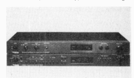
the SH-9038 and ST-9038

Technics, major manufacturer of audio equipment, has introduced a new microprocessor-controlled programming unit which enables the listener to pre-program his sound system up to a week in advance, with a total of 32 steps provided. The unit, model SH-9038, contains a "stereo computer brain" with a pre-programmable memory for the day of the week, time of day, a choice of eight