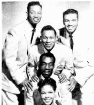
Recent fame in Vegas and their Mercury release "Only You and You Alone" has The Platters high stepping up the ladder of success.