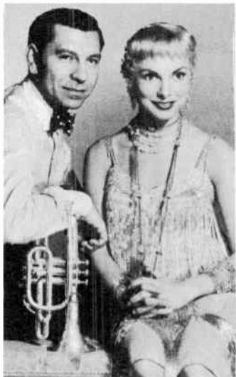
Reeking of the roaring twenties are Jack Webb and Janet Leigh as pictured in "Pete Kelly's Blues." Cap's Ray Anthony waxed title tune.