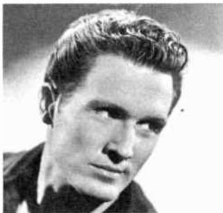
John Raitt, a Fullerton, California boy who sang his way to top roles on Broadway, is at his best in Cap album, "Highlights of Broadway."

This course in Lyric Writing, only one of its kind, attracts people of all ages and from all walks of life. In addition to the basic lectures and demonstrations, guest lecturers appear from time to time, including such music world notables as Oscar Hammerstein II,