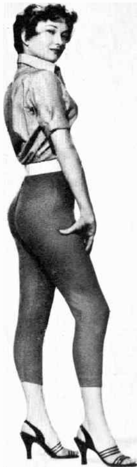
The likeness of Carol Ohmart will get the Vista Vision treatment when she makes her film debut in Paramount's "The Scarlet Hour."