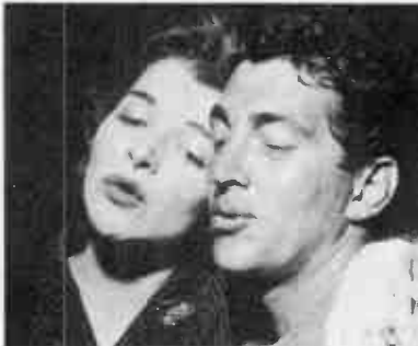
Dean and Line (names rhyme) whose full monikers are Dean Martin and Line Renaud, offer "Relax-Ay-Voo," "Two Sleepy People" as their first vocal duet recording for Capitol.