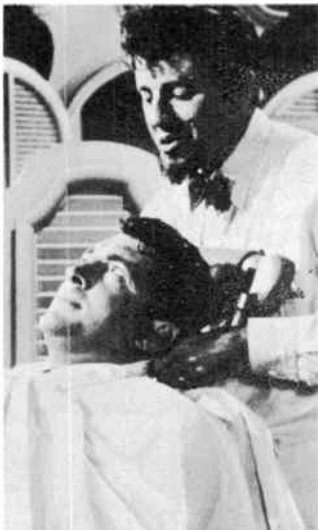
Jerry Lewis has close shave in store for Dean Martin in "You're Never Too Young," new Paramount film. Dean has new Capitol album.