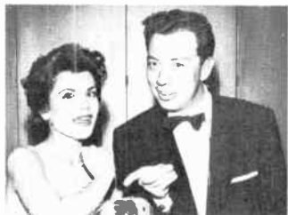
Cy Coleman accepts regal award from Eileen Barton at Composer, New York club. Crown was given for piano-composer achievements.

Ray Anthony's Capitol disk of "Pete Kelly's Blues," title song from Jack Webb's movie for Mark VII Productions at Warners, was recorded in the same studio in Hollywood where, eight years ago, Webb emoted as the star of the coast to coast Mutual network show, "Johnny Modero, Pier 13."