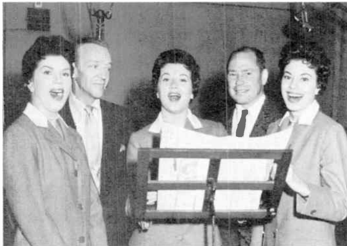
The McGuire Sisters attract the attention of Fred Astaire and Johnny Mercer. Their latest Coral platter is "Heart" and "Young and Foolish."