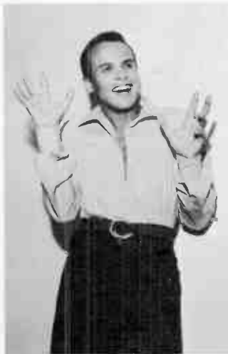
Harry Belafonte, who starred last in the movie "Carmen Jones" is pictured here rehearsing a dynamic folk song for upcoming show.

The Capitol baton-waver also scored another Republic flicker, "The Flame of the Islands," starring Yvonne DeCarlo and Zachary Scott, now screening nationally.