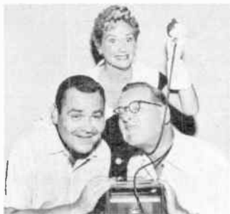
Thrush Lucille Norman "assists" comics Jonathan Winters, Ransom Sherman during recent NBC-TV "And Here's The Show" program.