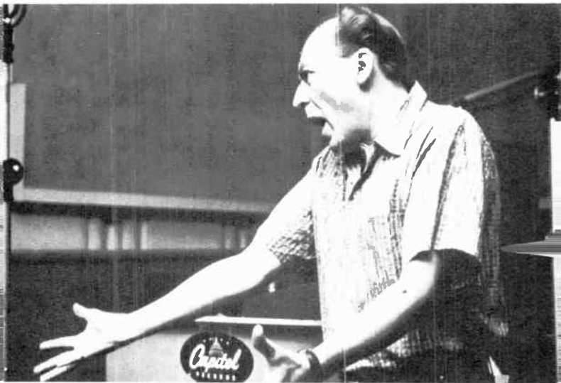
Woody Herman convincingly explains his point of view during record date "break" at Capitol. His new 45 rpm album, "Movie Themes," is hot seller.