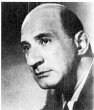
William Steinberg conducts the Pittsburgh Symphony in Tchaikovsky's "Symphony No. 5, E Minor, Op. 64" in a new Capitol album.

If your inclination is toward rail-type transit, climb aboard Milt Buckner's new Capitol album, "Rockin' with Milt," and