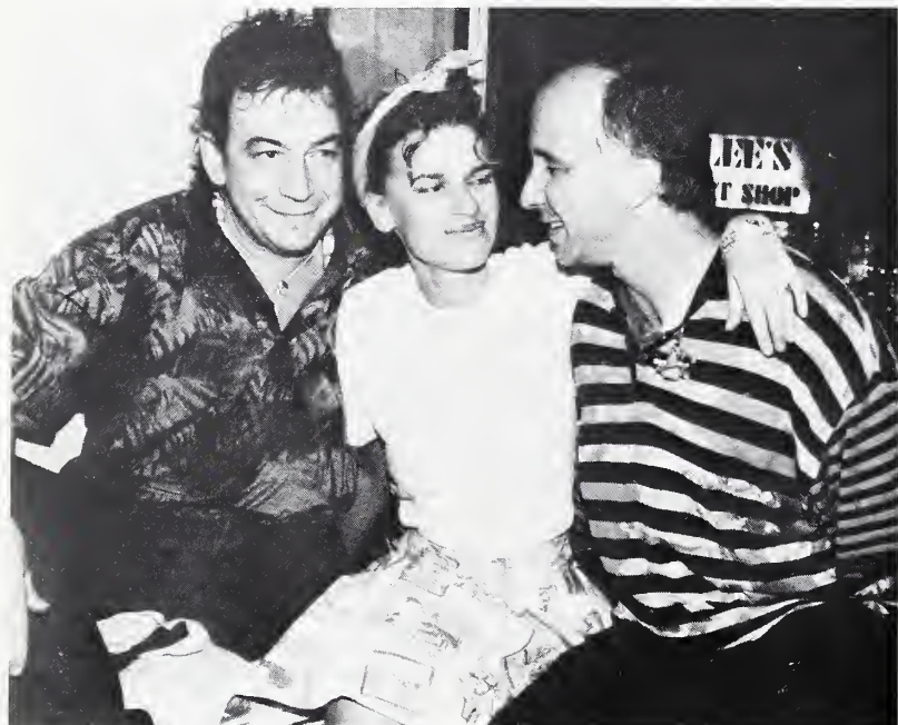
YOU ANIMAL! —Ex-Animal Eric Burdon was a recent guest on NBC Radio's The Paul Shaffer Show Live At The Hard Rock Cafe . Burdon is promoting his upcoming Faber and Faber book I Used To Be An Animal, But I'm Alright Now . Pictured (l-r) Burdon , Sandra Bernhard , Shaffer .