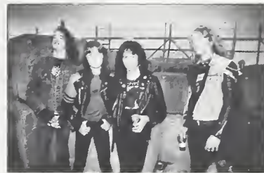
METAL'S FINEST —Elektra's Metallica bring their uncompromising brand of bone-crunching metal to the Felt Forum August 20.

Do For Me," sounding as fresh and flexible as Prince circa "Lady Cab Driver." By set's end people were still requesting songs. She asked the audience whether they wanted "Love Of A Lifetime" or "Ain't Nobody" and the crowd chose the latter. Chaka played it to its anthemic hilt, offsetting the funk with rock abrasiveness. Two encores later, people were still up and dancing to a quiet storm that had turned into a veritable electrical thunderstorm.