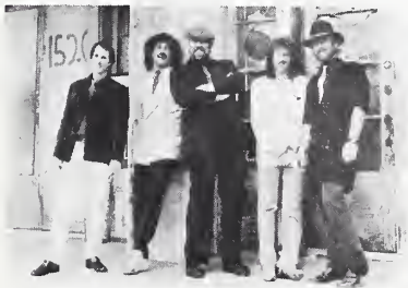
BUSTING OUT —L.A.'s The Bluesbusters come to Club Lingerie August 23.

ANKA WON'T RUN —Yeah, so there's an actor in the White House and he happens to be from California, but is this state turning into the land of the show biz candidate, or what? Well, in case you were stressing out over the issue, Points West now answers the burning question, "Will Paul Anka run for mayor?" The Monterey resident has conclusively nixed the rumor, which his publicists say got its start in Liz Smith's column for the New York Daily News. "I shall not run for office," the songwriter officiously states, "and if elected, I shall not serve." Meanwhile, a source at Monterey City Hall said she never even knew he was asked. Apparently, the rumor mills have been working overtime, and Anka says he's "flattered" at the notion, but he isn't politically inclined. "Besides," he further explains, "if ( Clint Eastwood ) is having trouble with the Carmel City Council, a simple, 'Go ahead . . . make my day' will keep them in tow. I doubt a stern chorus of 'Put Your Head On My Shoulder' would accomplish the same thing." Nevertheless, he will perform for that other California show biz politico at a White House state dinner September 18.