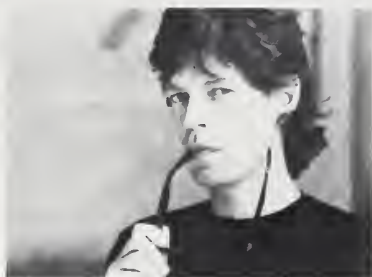
HOME VIDEO MICK —Mick Jagger's Running Out Of Luck comes to home video October 2 following a theatrical debut.

NOTES —Remember liner notes on albums? Time was, when you bought an album, you got more than just a record, its credits and maybe some lyrics. You got lots of delightful extraneous information. Liner notes ceased to appear on albums toward the end of the sixties, but some labels over at Sony Video Software have recognized a general outcry for their return and have come out with liner notes of their own—for videos. The company has devised a marketing scheme to allow space for some extensive musings, in the form of a fold-out flap with every video written on the inside. The first