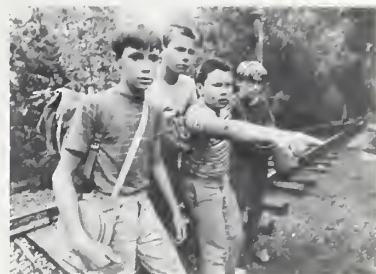
TAKING A MUSICAL STAND —The unique adventure of four boys in the late 50's is complemented by classic music from the era in Columbia Picture's Stand By Me . Atlantic is releasing the soundtrack.