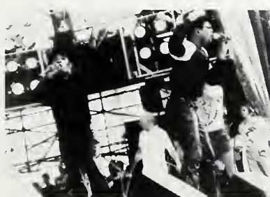
Walk This Way—Run DMC— (Profile)