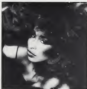
KHAN SHE EVER! —Chaka Khan sizzled on Pier 84 August 8, playing material from Rufus oldies to recent "Destiny" (Warner Bros.) tunes.