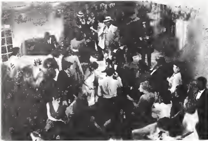
BIG TWIST JAMS — Alligator Records recently finished the label's first video clip which features Big Twist and The Mellow Fellows performing "300 Pounds of Heavenly Joy." Pictured here is the band jamming for a dancing crowd in a scene from the video.