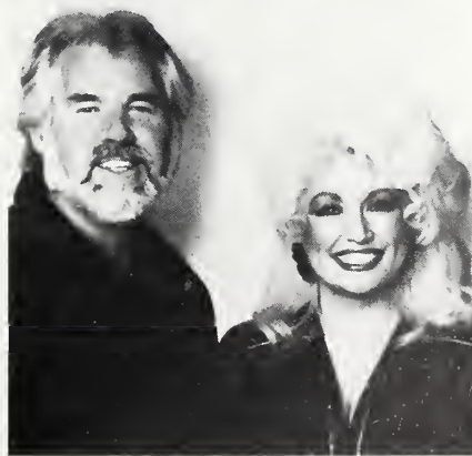
Kenny Rogers & Dolly Parton