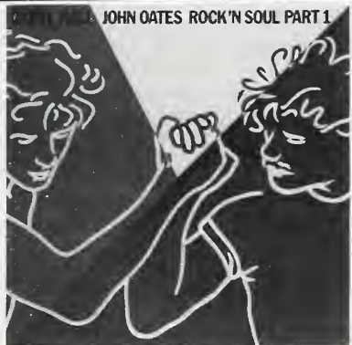
ROCK 'N SOUL PART 1 — Daryl Hall and John Oates — RCA CPL 1-4858 — Producer: Varlous — List: 8.98 — Bar Coded

Blue-eyed soulmeisters Daryl Hall and John Oates have written quite a few pop masterpieces in their 11 record career and all the singles featured on this greatest hits package have at least reached the Cash Box Top 5. Highlighting such hits as "Sara Smile," "Maneater," and "Rich Girl" the album also includes two new previously unreleased cuts to attract both the uninitiated listeners and the duo's longtime fans. The package also offers a calendar with each Hall and Oates album, in chronological order, representing a month of the year and ironically, "Rock 'n Soul Part 1" falls on the month of December. The perfect Christmas gift to give to a pop and soul lover who can't get enough.