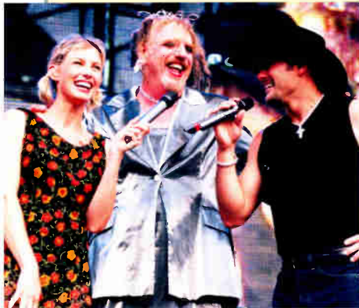
This year's George Strait Chevy Truck Country Music Festival turned out to be full of practical jokes and laughs. Asleep At The Wheel's Ray Benson (dress, hair and makeup courtesy of The Dixie Chicks) brought Tim McGraw to uncontrollable laughter as he strolled on stage during his song "It's Your Love." Fortunately, his real-life duet partner, Faith Hill, saved him and finished the performance. Pictured (L to R) : Hill, Benson and McGraw