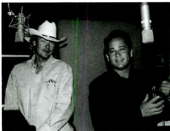
left Alan Jackson teamed up with sertaneja star Leonardo to re-record Jackson's hit "I'll Go On Loving You."