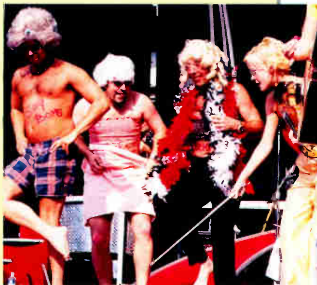
The Dixie Chicks also received a surprise during the George Strait Chevy Truck Country Music Festival. Pictured (L to R): BNA artist Kenny Chesney, Mercury artist Mark Wills and a Tim McGraw band member dressed up and danced with the Chicks during their performance of "There's Your Trouble."