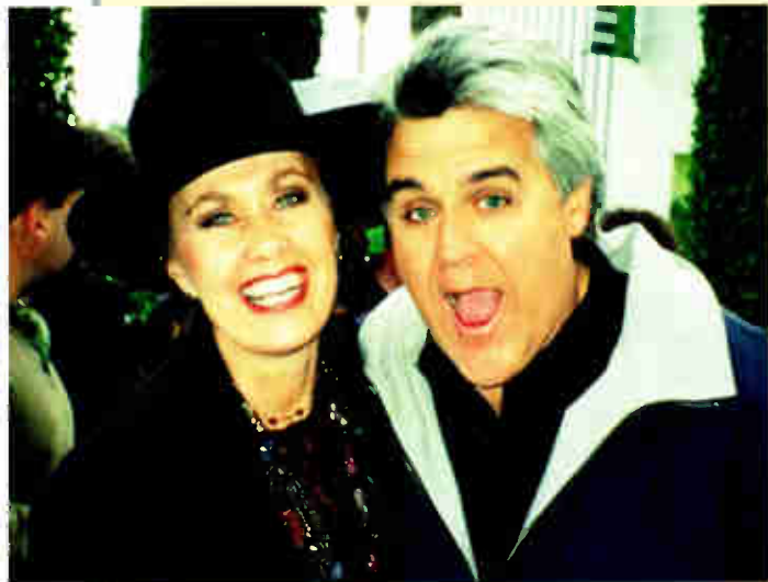
Janie Fricke caught up with "The Tonight Show" host Jay Leno on a recent visit to Los Angeles.