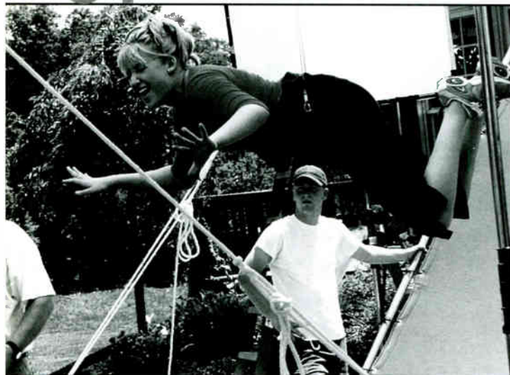
Teenage Country Music sensation, Lila McCann, was recently in Nashville to shoot the video "Crush", her latest single from her second album SOMETHING IN THE AIR .