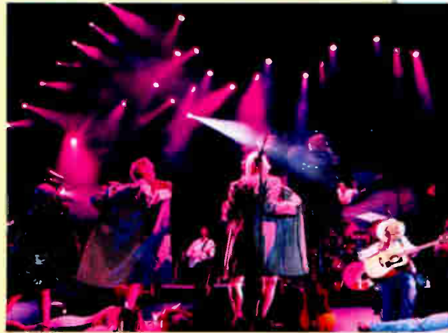
The Dixie Chicks made George Strait lose his composure when they staged a flashing of "false assets" during a recent concert for The George Strait Chevy Truck Country Music Festival.

Two popular Texas nightclubs, Billy Bob's Texas and Gilley's , are celebrating the live sounds of Country Music with upcoming CDs. BILLY BOB'S LIVE will feature live CDs of individual Country artists who play and have played at the nightclub, while LIVE AT GILLEY'S is a four-CD collection that features material from live Country shows at the nightclub from the 1980s. Stars including Rosanne Cash, Ernest Tubb, Jerry Lee Lewis and Willie Nelson will be featured on the CDs. QVC, the television shopping channel, put the package together for its own Q Records. <img alt="QVC logo" data-bbox="415 895 445 905"/>