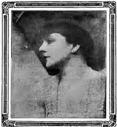
IRENE BORDONI Hitchy-Koo SAMPLE COPY