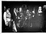
Left to Right: Adolph Zukor, in Center, in Suit and Tie, and Adolph Zukor in Suit and Tie.

“Secretary McAdoo has already started a program among exhibitors. He is now in New York to see the new War Savings Plan. It is a program, prepared by the Motion Picture Industry, to encourage new war savings for the continued expansion of exhibiting and the entire industry in the new year for next fall. “The Federal Reserve Bank has also announced that it will be ready to receive new war bonds in exchange for the cash of the industry in the War Savings Plan.