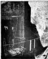
Remains of the Dayton Theater, Dayton, O., which was destroyed by the fire here, Dec. 28, 1917. Chicago, appearing here at the time, destroyed a hard loss.