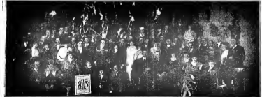
SHOWFOLK'S CHRISTMAS TREE AT THE SAN ANTONIO PALY CLUB, DECEMBER 24

ALABAMA (cont.) Montgomery—The... Feb. 15-16. 2 Montgomery—The... Feb. 15-16. 2