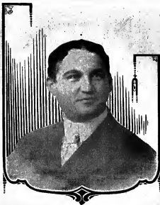
MAX SPIEGEL one of Burlesques Foremost Producers