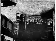
Billboard display at Hotel Hannah, Cleveland, Ohio. Billboard display at Hotel Hannah, Cleveland, Ohio. Billboard display at Hotel Hannah, Cleveland, Ohio.

BILLBOARD DISPLAY AT HOTEL HANNAH, CLEVELAND, O.