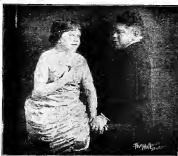
The vaudeville pair has remained on a vaudeville tour in this country and abroad, having just returned from a tour in Europe.