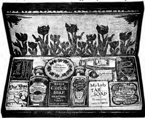
Lucky 11's Combination in Display Case—Store Value $3.35.

11 High class standard toilet articles which are in big demand everywhere. 11 big values, each full drug store size. Retail value $3.35. Costs you only 65c in quantities. You sell for $1.50 to $2.00 and make from 100% to 200% profit. Lucky 11 is the fastest seller ever put on the market. Goes like hot-cakes. When you show your customer this beautiful toilet set, the flash and riot of color will dazzle her eyes. Everybody wants it—everybody buys. Don't miss out on this Big Special Offer.