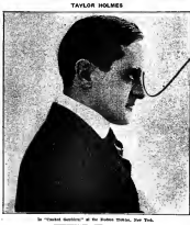
in "Faded Destinies" at the Fulton Theatre, New York.