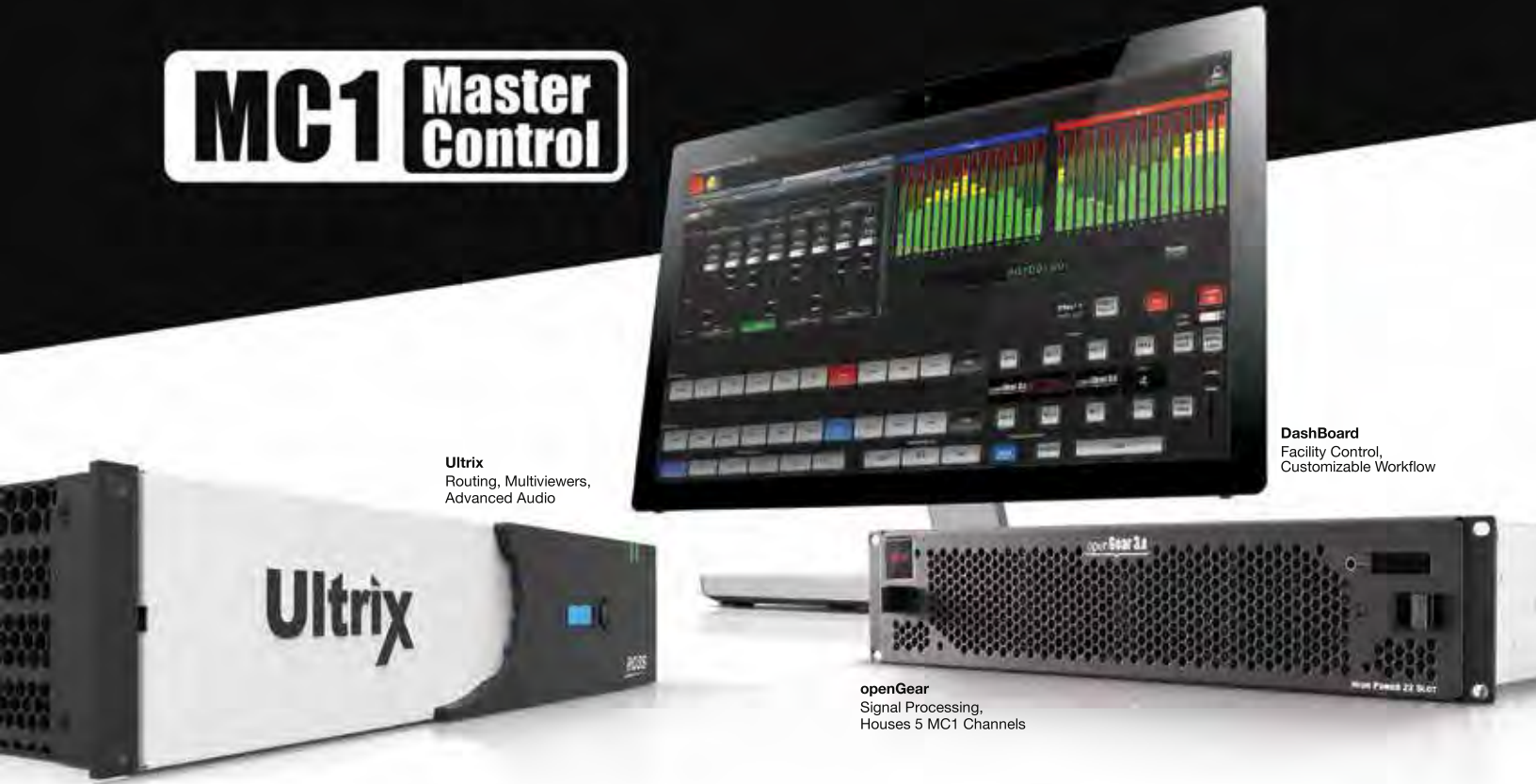
Ultrix Routing, Multiviewers, Advanced Audio