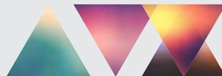
ROCKY MOUNTAIN AUDIO VIDEO EXPO

The 2017 AVX experience will expand your mind, skills and capabilities. You and your colleagues will learn at any of our free seminars led by true trailblazers in their respective fields. We offer learning pavilions where the most qualified instructors provide a hands-on learning experience with Adobe and Apple Pro App certified trainings. The most incredible business resources are at your