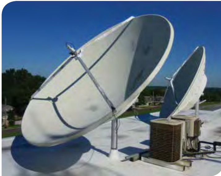
Did you reaim a satellite receive antenna? Stations that changed from AMC-8 (right) to AMC-18 may have new snow accumulation challenges.

6. Are you prepared to clean out our newly reaimed snow catchers (a.k.a., AMC-18 dish)? I fear the new AMC-18 look angle will be much more susceptible to snow accumulation than was AMC-8. I, for years, have been carrying a plastic broom with snap-on dustpan to shovel/rake snow out of dishes. I am going to add an extendable plastic roof rake to the truck for the first snow adventure. I have already had a talk and demo with most of my clients to show them