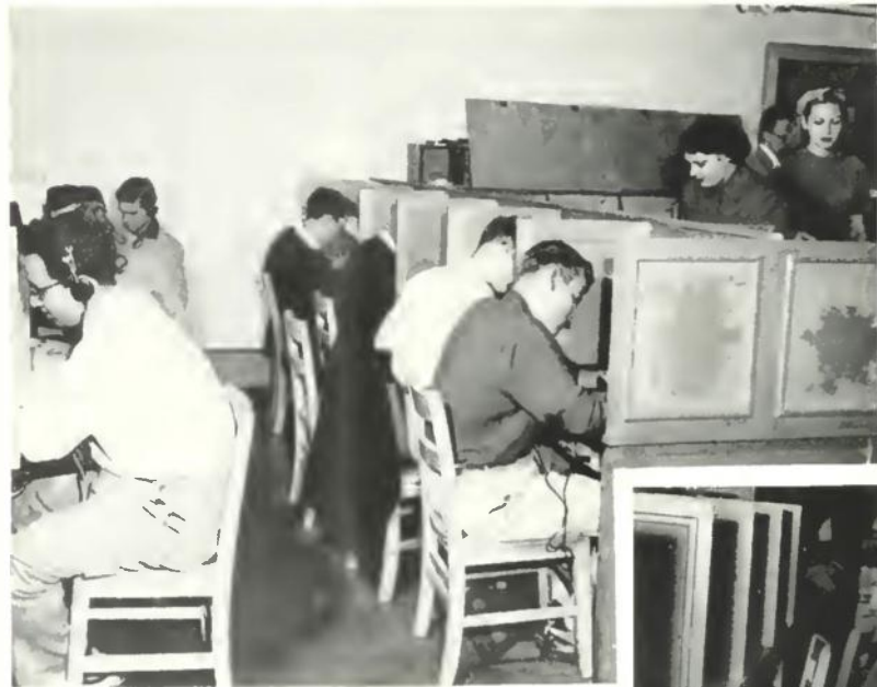
Above. These students busy in booths are studying tape recorded language lessons in the University of Florida's new Language Laboratory. Members of this group are working in Spanish, French, German, Portuguese and Russian.

The present laboratory setup includes 70 booths mounted on tables and connected by five separate channels to a bank of five BK-411 Soundmirror tape recorders located at the front of the room. Each listening booth is provided with a row of five telephone jacks, one for each recorder channel. The student simply plugs in his headset on the channel which is playing the recording of his particular class and lesson. The lessons to be played on each channel are an-