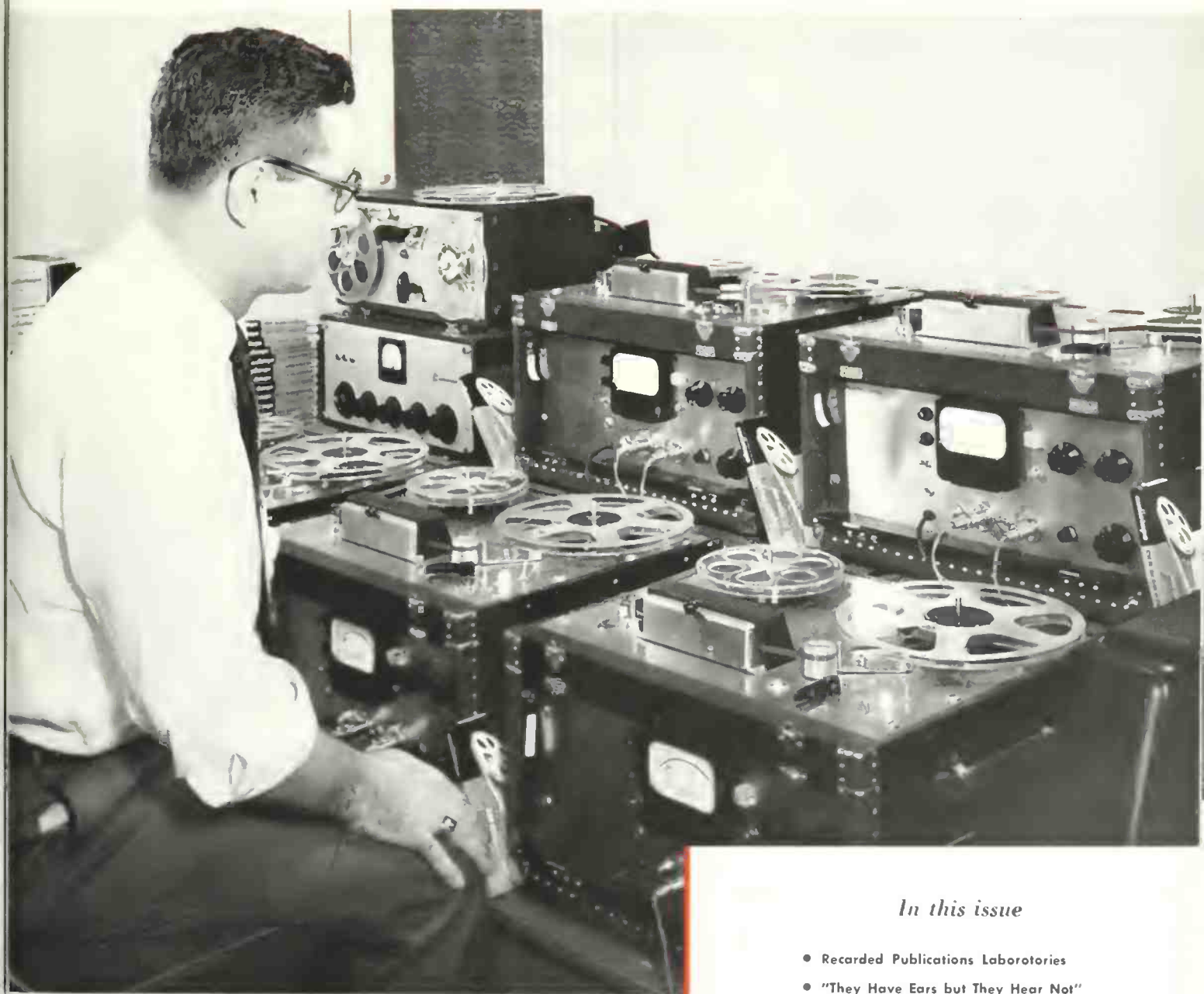
Multiple recorder set-up for duplication of recorded tapes at Recorded Publications Laboratories, Camden, N. J. Story on Page 2.