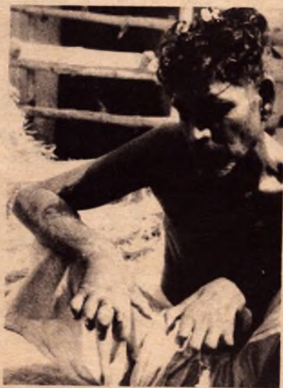
This pitiful fellow is one of hundreds waiting for you in India.

AI-357 - GENERAL PRACTITIONER with interest in Pediatrics for 6 months (min.) in Uganda hospital. Residence is provided. (Uganda is one of the most unbelievably beautiful of Africa's countries and abounds in lakes, rivers and waterfalls.)