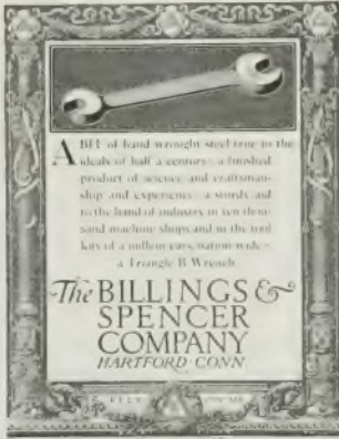
The Wrench Was Made a Symbol of the Company's Standards

To the man on the inside the names of its builders lend initial impressiveness. "Copy by Groesbeck, illustration by Ball and Booth, borders by Teague" is a line to awaken keen anticipation in the mind of the man on the lookout for a balanced campaign on a high plane of excellence. But the man on the inside, as well as the man on the outside, will judge by