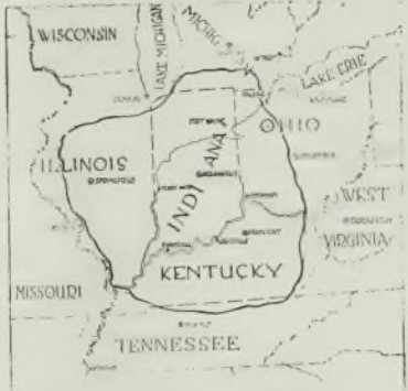
Indianapolis Jobbers Sold $19,000,000 of Merchandise to the 2,344 Retailers in This Territory in 1919