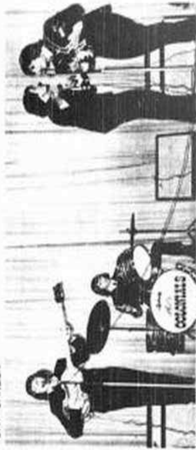
COLONIALS AT TRENDSETTER