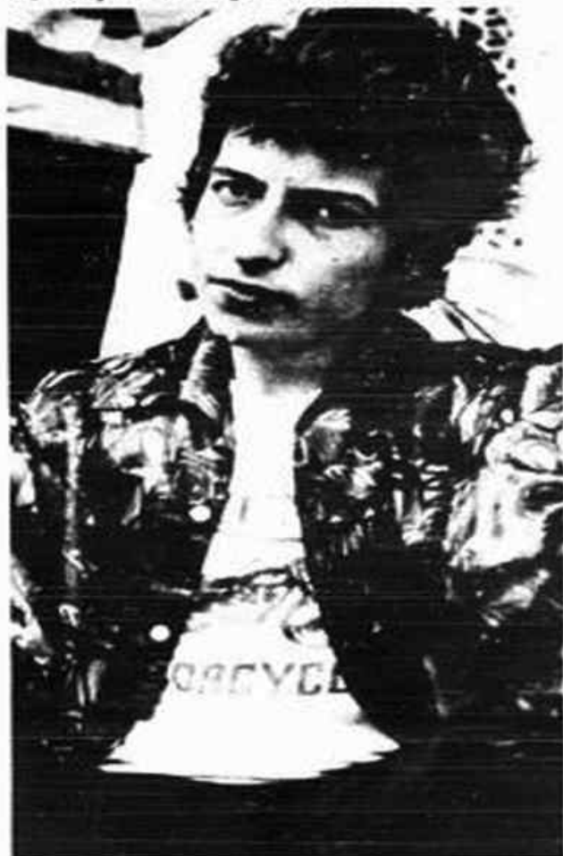
You know who: from you know where