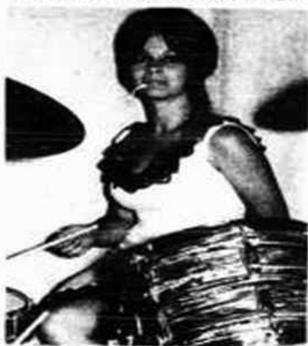
At 10th Ave.