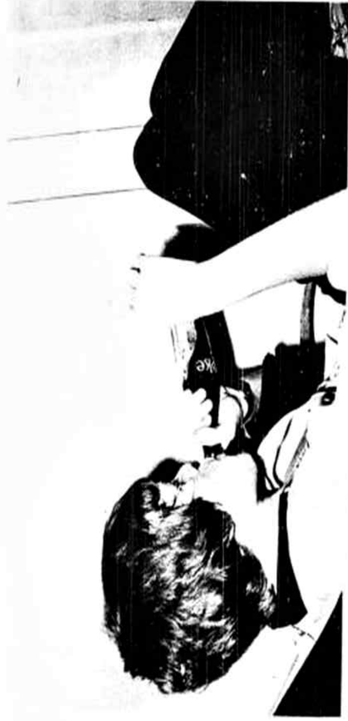
Hermin douses for bottle-feeding Tween acts