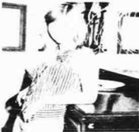
Strikes are in