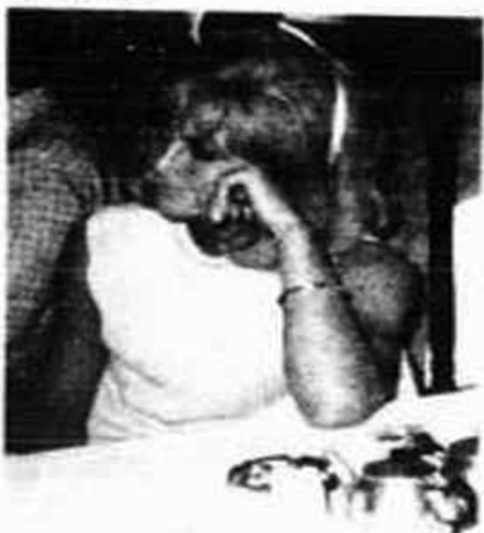
Seen at Pinocchio's