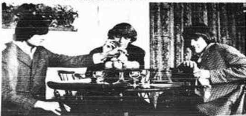
A fruity group

D. "Our new record will be out in a week and a half, called 'Remember walking in the Sand', backed by one of their own compositions 'If You Were Mike'."