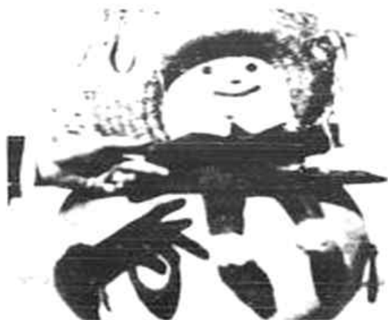
Limited (never before seen in public)