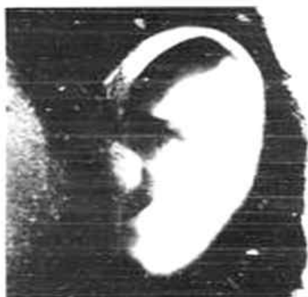
What's this ere?