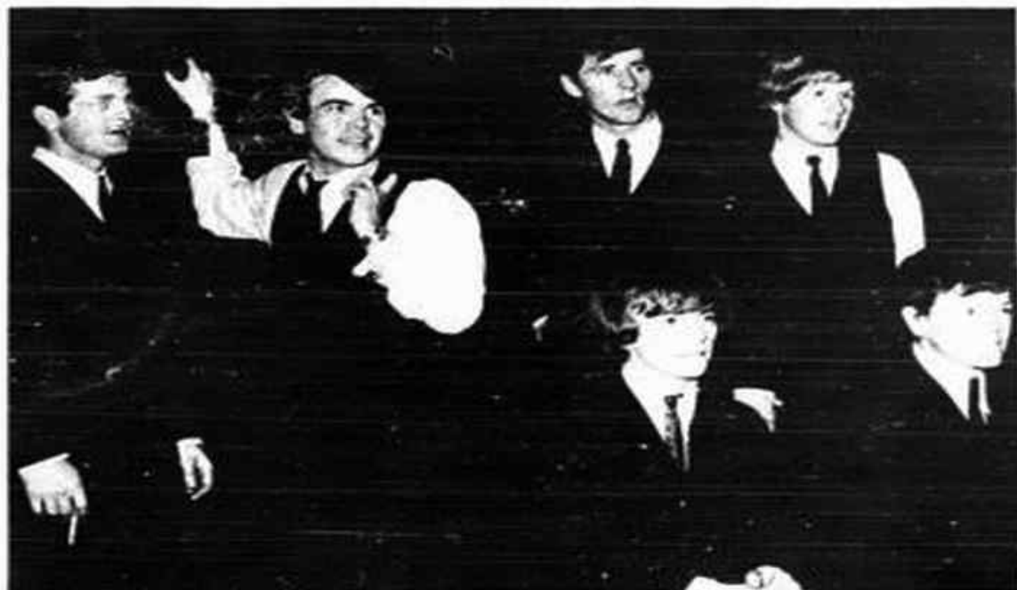
The Twilighters backstage at the Palais