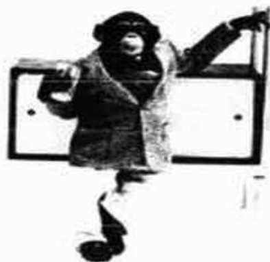
Seen at Go-Set