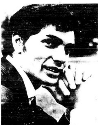
Englebert Humperdink — a famous name.

"What's in a name?" wrote William Shakespeare. He obviously hadn't heard of Englebert Humperdink.