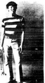
Great! Maxine's whose record "Grazing in the Grass" has been No. 1 in the 100 American cash box listings, and is now No. 14.

Mick Jagger stated "I hate doing public performances, but I would love to tour Australia again" could it possibly be January?