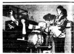
The Lords of London are Canada's top group. Their single "Contakaka and Icecream" reached No. 1 over there. It was released on an E.P. last week in Australia, but so far has failed to gain any significant airplay.

Now Englebert has a string of hits behind him and rivals Tom Jones as England's greatest male singer. His likes, you guessed it, Indian curries and money in the bank.