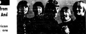
GARY PUCKETT AND THE UNION GAP

Gary Puckett and the Union Gap have had three world-wide smash hits in a row. Gary Puckett has been with the Union Gap for two and a half years. He now lives in San Diego, California. He has light brown hair and is six feet tall.