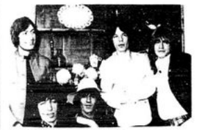
The Stones today.

"I think perhaps it was slightly in the wrong direction. A bit too advanced for our fans." The Stones, however, didn't feel the need to worry about this single.