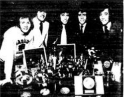
The Bee Gees and all their awards.

It shows them with the incredible array of trophies they have amassed in less than 18 months including three Gold Discs (for the 5-million seller "Massachusetts" and 2 million plus sellers "World" and "Worlds"), a number of Silver Discs, the Radio Luxembourg Group of 1967 award, "Britain's Best New Group" of 1967 and "Valentine" (Britain's Brightest Hope of 1968) trophy. In all their records have scored for them 27 No. 1 hits in 15 countries.