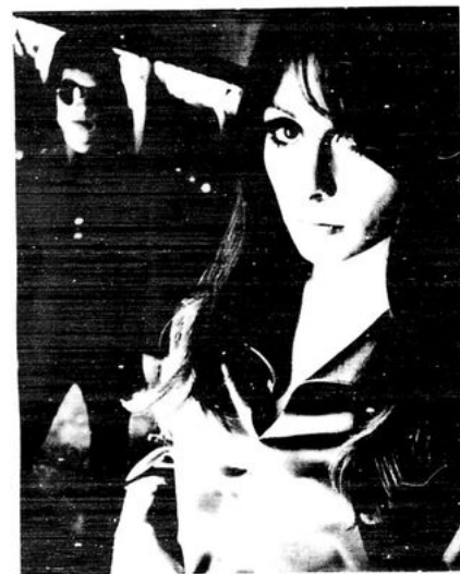
Dashing look in a New Lean Line Suit. High buttoning on long slim jacket. Pants have unusual "diagonal" fly-zip. $65. Night colors, brown, heavy, maroon, blue, light blue, grey, green and mustard. Michelle, stunning in a feminine silk, short-blouse, with revealing plunge neck-line. $7.50. Seven colors, red, green, black, pink, salmon, and light blue. Crepe slacks (not shown). $16.50.