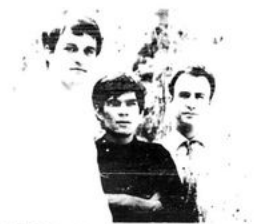
The Parades follow up their hit of last year "The Radio Song" with a rather disappointing single titled "She Sings Alone" the backing is as depressing as the lyrics.