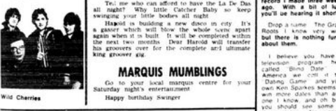
THEY'RE COMING soon on ASTOR