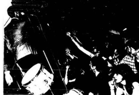
• Wildside compere Ian Simpson giving away some presses to the crowd.