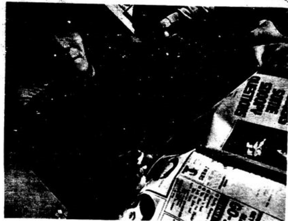
● Mac relaxing with GO-SET, after their 36-hour flight from England.