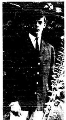
* Singing is much harder than plumbing . . .