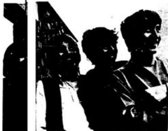
● The Small Faces, Mac, Steve, Ronnie, and Kenny on the balcony of their hotel overlooking the harbour.