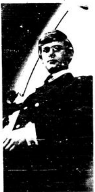
* A girl I used to know called me a snob . . .