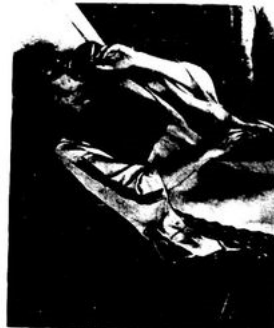
● The Small Faces manager, Andrew Loog Oldham.