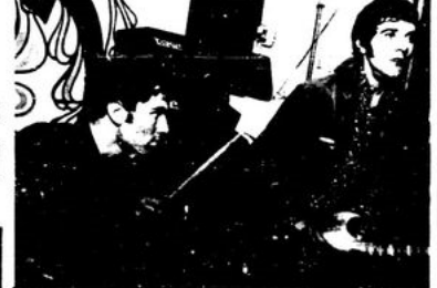
• The Procession, still working hard, at the Thumpin' Tum.