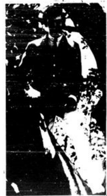
* I really dig signing autographs.