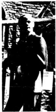
* If the record goes we may go to America.

Screaming girls mob him! Mums and dads love him! Almost overnight Johnny Farnham has changed from an unknown 18-year-old apprentice plumber, who loved drivin', discos and his mates, to becoming the hottest show business property since Normie Rowe.