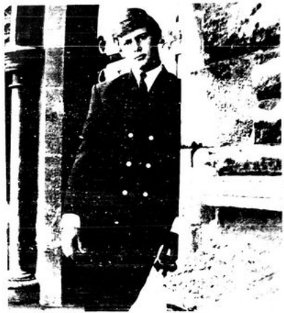
* JOHNNY FARNHAM