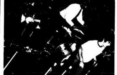
• The Cherokees at Impulse.