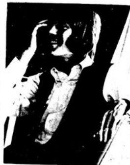
● Here is Steve Marriot, talking to Ian Meldrum.