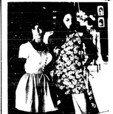
LEFT: Cotton Clifton party frock styled by Kenneth Perry. Semi-scoop neckline and sleeves have a dainty trim, buttons to the waist and a self tie belt. XS5W - 55W $23.00 RIGHT: Playful by Kenneth Perry with 8 button up skirt. Flower-embroidered fabric is cotton, with 14 button front. XS5.2 - 5W $21.00