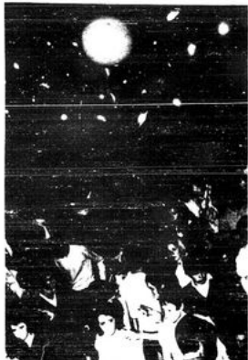
● The crowd at Melbourne's Catcher on New Year's Eve, balloons and all