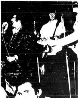
● St. Louis Union at Lord John's Disco, (would you believe) New Year's Eve