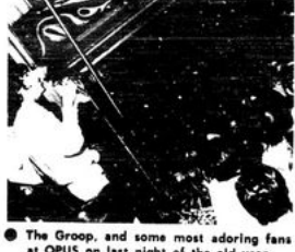
● The Groop, and some most adoring fans at OPUS on last night of the old year