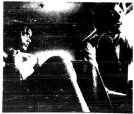
● The Gibb brothers in their penthouse suite, on the 13th floor of the Chevron Hilton, in Sydney. They flew to Australia with their manager Robert Stigwood, for a brief Christmas visit