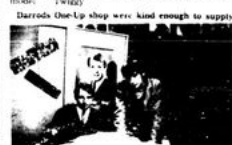
Darrods One-Up shop were kind enough to supply

Over the last few weeks, Go-Set has been running some weird and wonderful competitions. Apart from the normal "Win an L.P." type of thing, we've had panties in cans (for the birds only, of course), and we've asked you to design a front cover suitable for Go-Set.