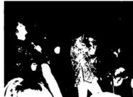
• The Dream, fabulous new group made up of The Final Four and The Changing Times, let out with their brilliant vocals at Tom Foolery.