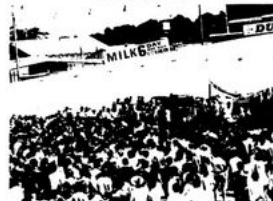
A few of the happy summery revellers, at the spectacular happening.