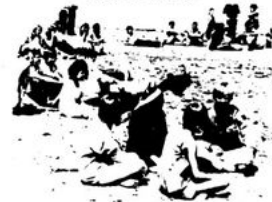
• Can anyone think of a better way of spending a sunny Sunday afternoon? This group of swingers had a sun bake while it all happened.