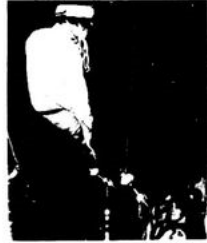
• We've never heard of a sexy Father Christmas before! Have you?