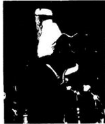
• This version of Father Christmas is very unusual — he takes off his clothes in public!