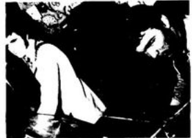
• The Procession working hard at the world's most beautiful discotheque — Victoria and Albert.