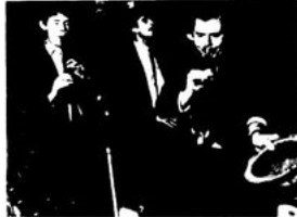
• The Yarra Yarra New Orleans Jazz Band at The Catcher, and everyone yelled and shrieked and screamed for more.