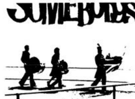
• The Chelsea Set did a few monoculars before they settled down to play some groovy-type pop music.