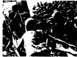
GO-SET's super-swift photographer, Jim, caught the action at the velodrome, at the 3XY Happening.