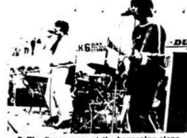
• The Group were at the happening along with 4,000 others, freaking out on a sunny Sunday.