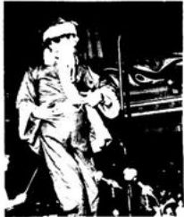
• If you still believe in Father Christmas, don't read this!