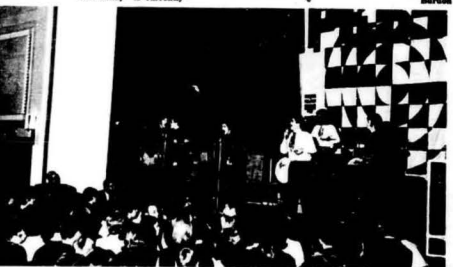
Like so many groups with new records just released, the Twilight are fast out making personal appearances all over Australia. Here they are caught in action at the Box Hill dance trumpet.