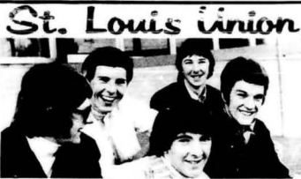
St. Louis Union BOOKINGS — 62 7268 FAN CLUB — 19 SERVICE STREET, HAMPTON