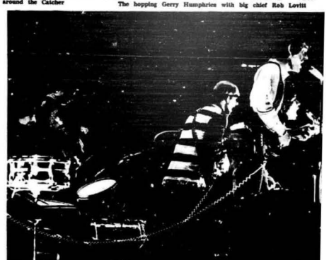
A shot of all the Animals taken during the Sydney concert. The Animals latest record with Er Burdon supplying the voice hit "When I was Young" at 2 on the Go-Set Top 40 Sale.