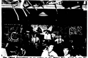
The "Mind Excursion" at an evening at the Billing Eye. Good to see the drummer from the Files in action again.