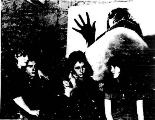
Some of the Catcher kids in front of one of the larger than life photos hanging around the Catcher.