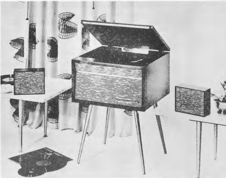
The Mark 32, a transitional-styled console, is included in the 1960 line of multi-channel stereo "Victrola" phonographs.

Double, swing-out speakers, which can be removed and placed elsewhere in the room to produce three separate stereo sound sources are featured on two new portable "Victrola" phonographs which have been added to the 1960 line of stereo instruments.