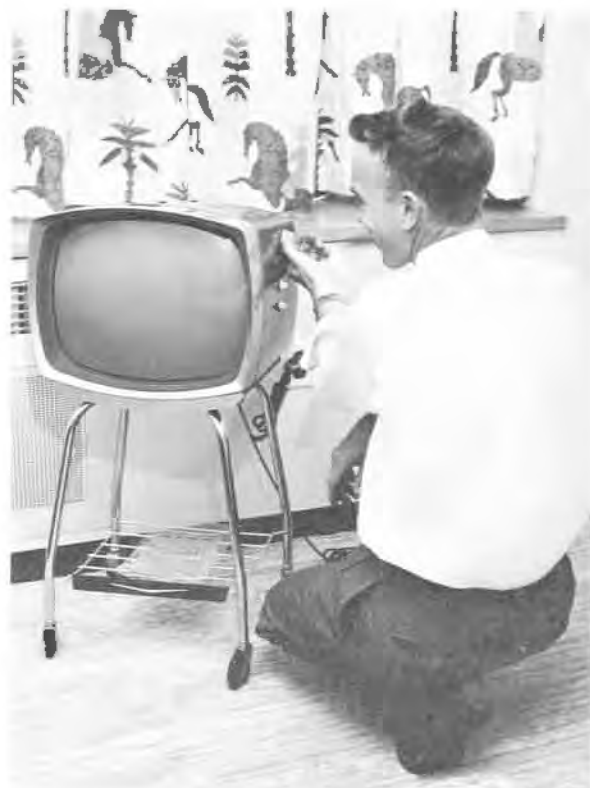
Guest-room sets are specially engineered for commercial use: have tamper-proof backs.