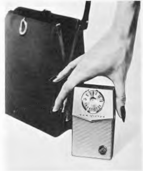
All American ITP2

Two tiny radios, engineered and assembled with the precision of a fine watch, marked RCA Victor's entry into the miniature radio field.