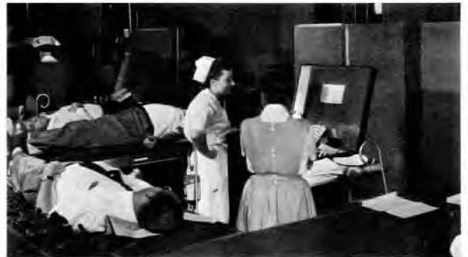
The BMEWS cafeteria, made available by RCA for the Drive, resembled a field hospital. It was equipped to handle eight donors every fifteen minutes.

The 134 pints of blood contributed was above the blood drive aim: 125 pints in each of 32 annual visits, or a total of 4,500 pints of blood each year in the county.