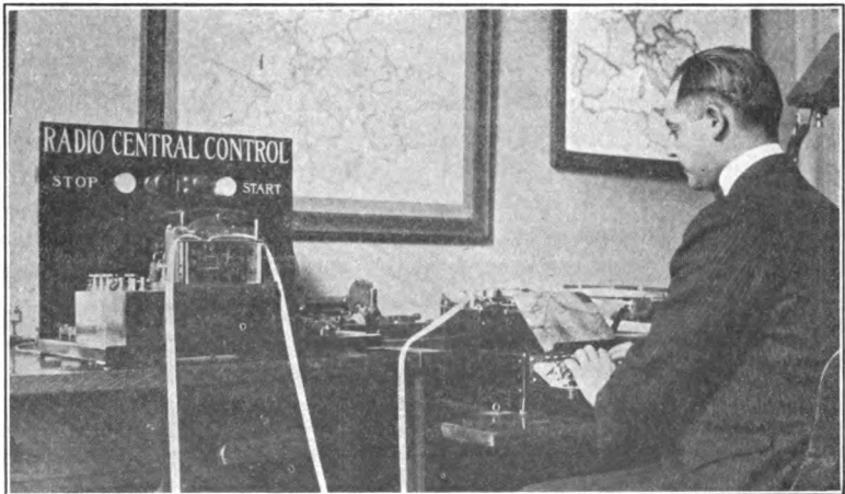
SWITCH PRESSED BY PRESIDENT HARDING FOR INAUGURATION OF RADIO CENTRAL

Having made that point clear, and understanding each other as we now do, we wish to offer this little reminder of our first party, which will take the form of a dance at the Apollo Studio, Brooklyn, on the evening of February 10. Come all, for there is bound to be a great deal of fun, and you will surely have a good time. By all means, see that you are well supplied with tickets.