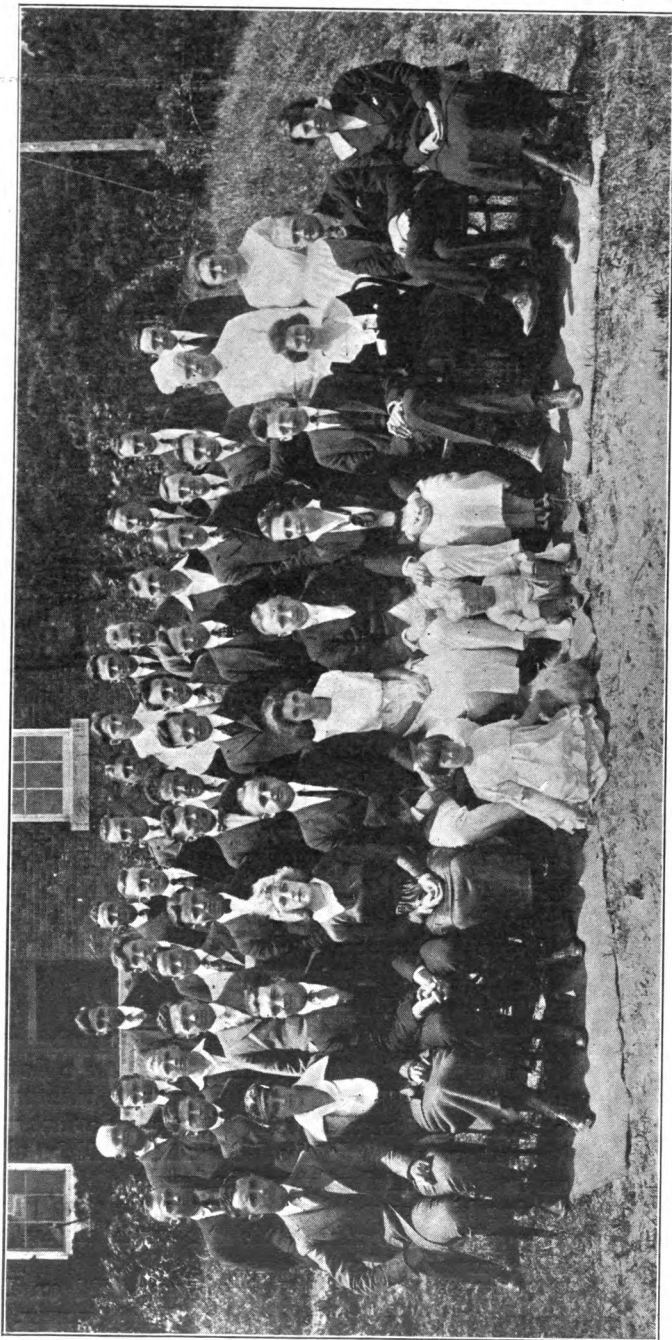
THE CHATHAM STAFF