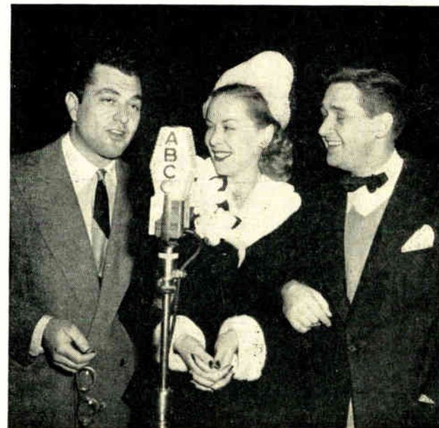
Left to right: Tony Martin, Evelyn Knight, Alan Young, heard Wednesday at 9:30 P.M. over ABC-KECA on "The Tony Martin Show."

Like Martin, under contract to 20th Century-Fox, Young is rapidly becoming as