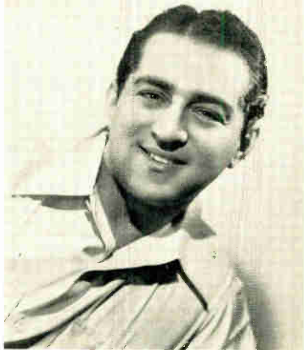
Baritone Robert Merrill, RCA Victor recording artist, is featured every Sunday over NBC (11:00 to 11:30 PST) on RCA Victor show "MUSIC AMERICA LOVES BEST."