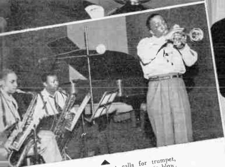
When the arrangement calls for trumpet, Erskine Hawkins immediately starts to blow. The band is at NY's Hotel Lincoln.