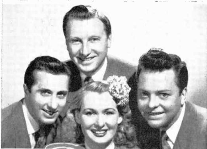
Radio's hottest group pack a real lyrical wallop. Their first RCA Victor platter is "Personality" and "Love Is So Terrific."

Three guys and a gal who have come a long way in one year are now contracted exclusively to RCA VICTOR. Perry Como's sensational platter, Dig You Later , brought the Satisfiers into front-room circles where records are played. And their stellar work on The Chesterfield Supper Club five nites a week has brought them many bouquets and admirers. Their first records were recently made and their initial release is Personality from Paramount's "Road to Utopia" and Love Is So Terrific .