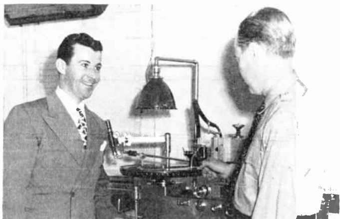
Dennis Day gets a lesson in the technique of recording from the RCA Victor engineer at his recent date to do "Shamrock Melodies."