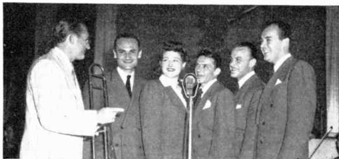
We got this one out of the files — gal is Jo Stafford and the guy on her left is a singer by the name of Sinatra. It's Tommy Dorsey's old Pied Pipers.