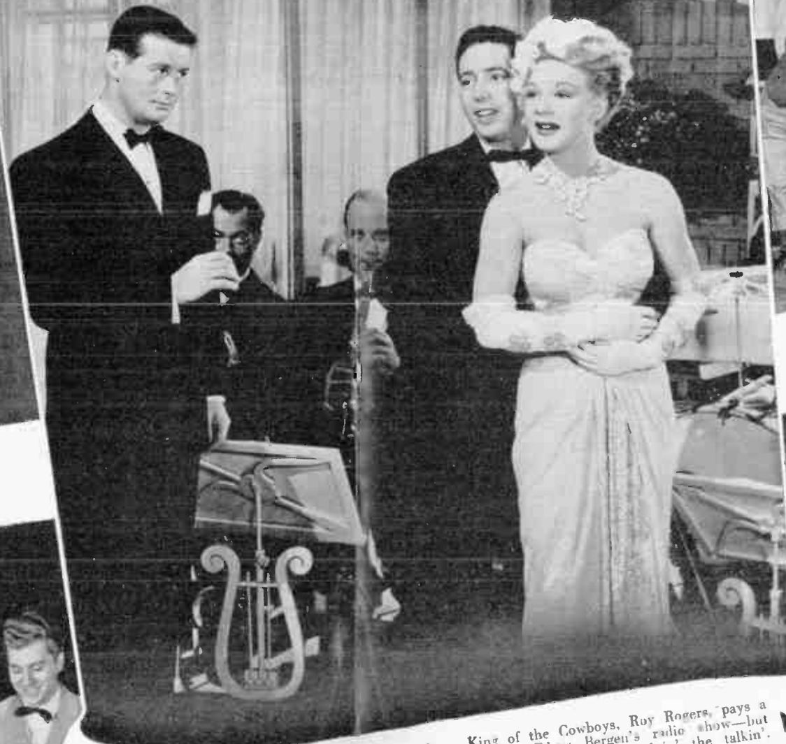
Betty Hutton and Andy Russell sing together as Don DeFore leads the band—it's a scene from "Stork Club" (20th Century-Fox).