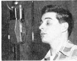
Up and coming Johnny Desmond lends that "woolly west" touch as he makes his first disks for RCA Victor.

With coffee in hand, Perry Como makes another hit in "Here Comes Heaven Again." (Space cut the coffee, Ed.)