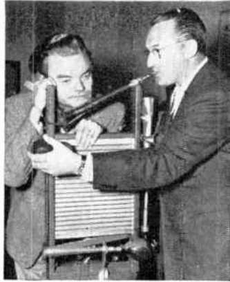
Spike Jones must have been pretty fired when this was taken—or else Mr. TD doesn't play a good "wash-board."

One of the outstanding drummers before the war, Ray McKinley has returned to orchestra leading with a new outfit that is definitely one to be watched. McKinley was with the Glenn Miller AAF Band but decided to go on his own when he was discharged along with other members of the famous group. After a rest in his native Texas, Ray came East and is the current attraction at the Commodore. Following are dates at the Strand Theater and Frank Dailey's Meadowbrook. Six months' hookings for a brand new band ain't hay.