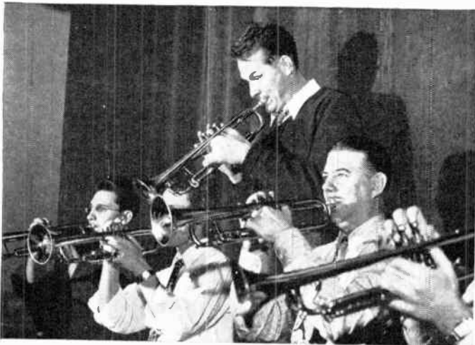
In addition to his singing chores, Vaughn Monroe also plays a mean trumpet. Monroe plays with the band at all record sessions.