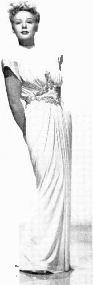
Here's one good reason why you should see Betty Hutton in "Stork Club."

Betty Hutton has signed an exclusive recording contract with RCA VICTOR and will soon cut her first platters. Miss Hutton's first release may be out by the time you read this. The popular motion picture star has made several hit disks in the past and is easily one of the great favorites of the day. Her last picture for Paramount is "Stork Club" and it is proving to be her most successful flicker to date. Her next is a comedy-drama called "Cross My Heart" with Sonny Tufts. It's set for late July release