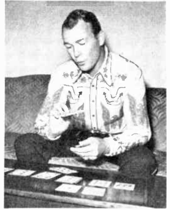
When Roy Rogers has a few minutes for relaxation, one of his favorite pastimes is solitaire. (No, he doesn't cheat.)

His latest one is Rock Me To Sleep In My Saddle and I Wish I Had Never Met Sunshine . Roy's distinctive western style make his records best sellers wherever western music is played. At present he is busy at Republic Pictures.