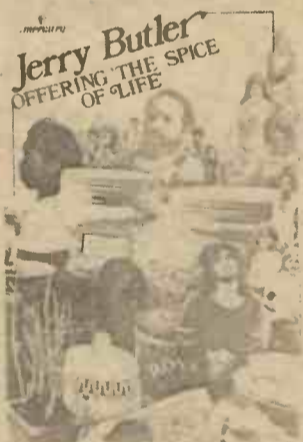
Offering The "Spice Of Life" - Jerry Butler - 8-track 7708 160

JEAN-JACQUES PERREY - "The Amazing New Electronic Pop Sound of Jean Jacques Perrey" More electronically synthesised music from the man who is becoming accepted as its finest exponent using, as he does, a variety of electronic musical instruments including the Ondes Martenot, ondioline, Moog synthesiser and the Allen series of keyboard instruments along with magnetic tapes. All the tracks are original pieces written mainly by Perrey himself for this new musical medium.