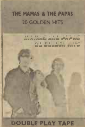
20 Golden Hits - The Mamas & The Papas - TC2-GTSP 200