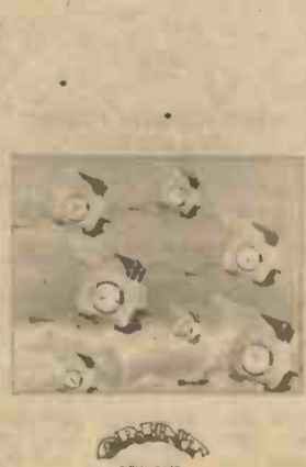
Thirty Seconds Over Winterland - Jefferson Airplane - BFK1-0147.