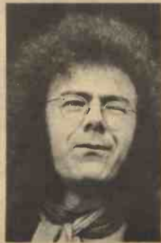
Bob Fripp... guesting?

PFM, who have also had their first album released on Manticore, produced by Sinfield, are presently working on a second album for release this autumn.