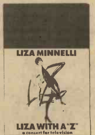
Liza with a Z - Liza Minelli - CBS 65212