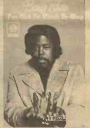
I've Got So Much To Give - Barry White - ZCP 28175.