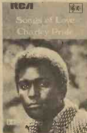
Songs Of Love - Charley Pride - MPK 170.