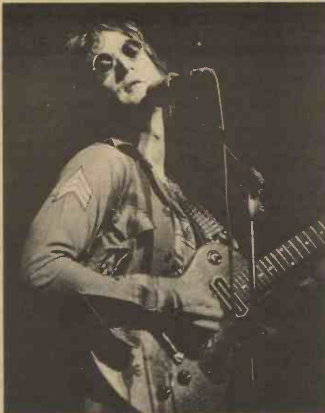
JOHN LENNON: remembering his old songs.