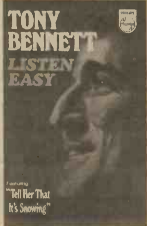
Listen Easy - Tony Bennett - 8-track 7711 046