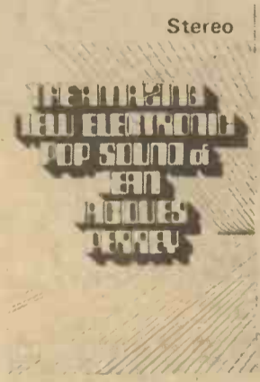
The Amazing New Electronic Pop Sound - Jean Jacques Perrey - VK 792 86.