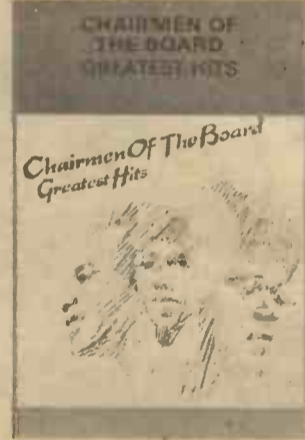
Chairmen of the Board Greatest Hits - Chairmen of the Board - TC-SVT 1009