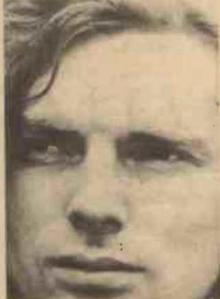
Van Morrison - went to the States

Morrison has just completed his sixth album for Warner Brothers.