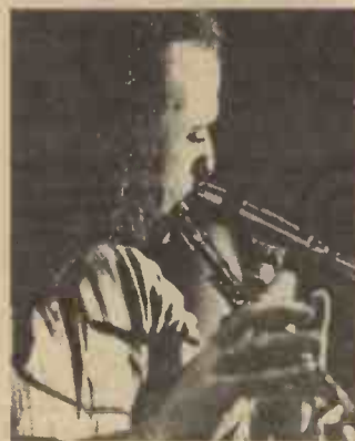
Thijs Van Leer

You can still half-stop a hole to get a semitone or even quartertone, and