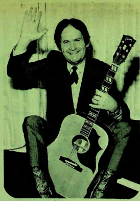
HANK LOCKLIN—his top ten hit here was "Flexie Hee, Hee, Hee Falling"

"Have you met Presley? I've," he said, "I met him before he ever made it big and as you all know he's a real gentleman, always. I met him at a party where he was talking about his career, though," he explained "Do you know about every two years Elvis just fades away completely from the scene altogether. They can find his records, but he's records away, and then suddenly, boom, there he is again!" He