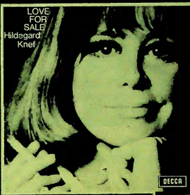
LOVE FOR SALE Hildegard Knef