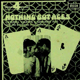
Caterina Valente & Edmundo Ros Nothing but aces