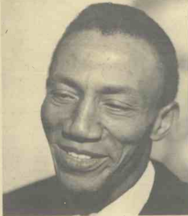
LEE DORSEY

And not only do they have a tradition of hits — they also have a reputation for exploding on stage and driving