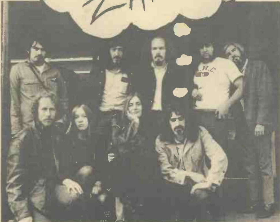
THE MOTHERS OF INVENTION with Frank Zappa. The group's two LP's "Freak Out" and "Absolutely Free" have been moderately successful here.

O VER the past few years the record producer—formerly back-room boy of the pop world—has come into his own. George Martin garnered almost as much publicity as the Beatles when the Liverpool foursome first made the charts. Andrew Oldham followed the pattern with the Stones, and, more recently, Denny Cordell—A and R man for the Procol Harum and Georgie Fame, among others—has had his share of the limelight.