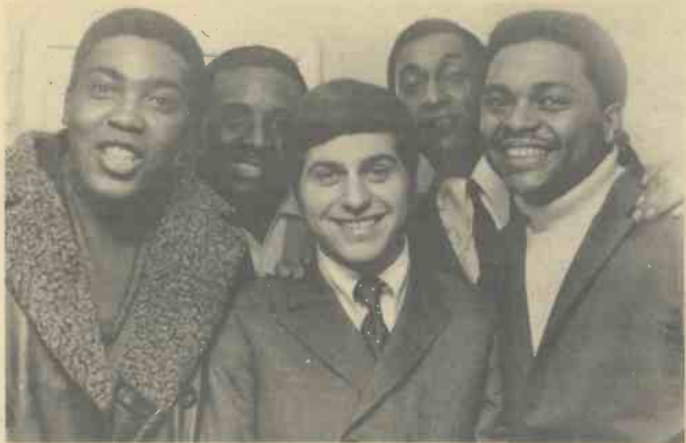
THE FOUR TOPS seen with JOHNNY RIVERS — the Tops LP is reviewed on this page, and Johnny's latest LP release is "Rewind".