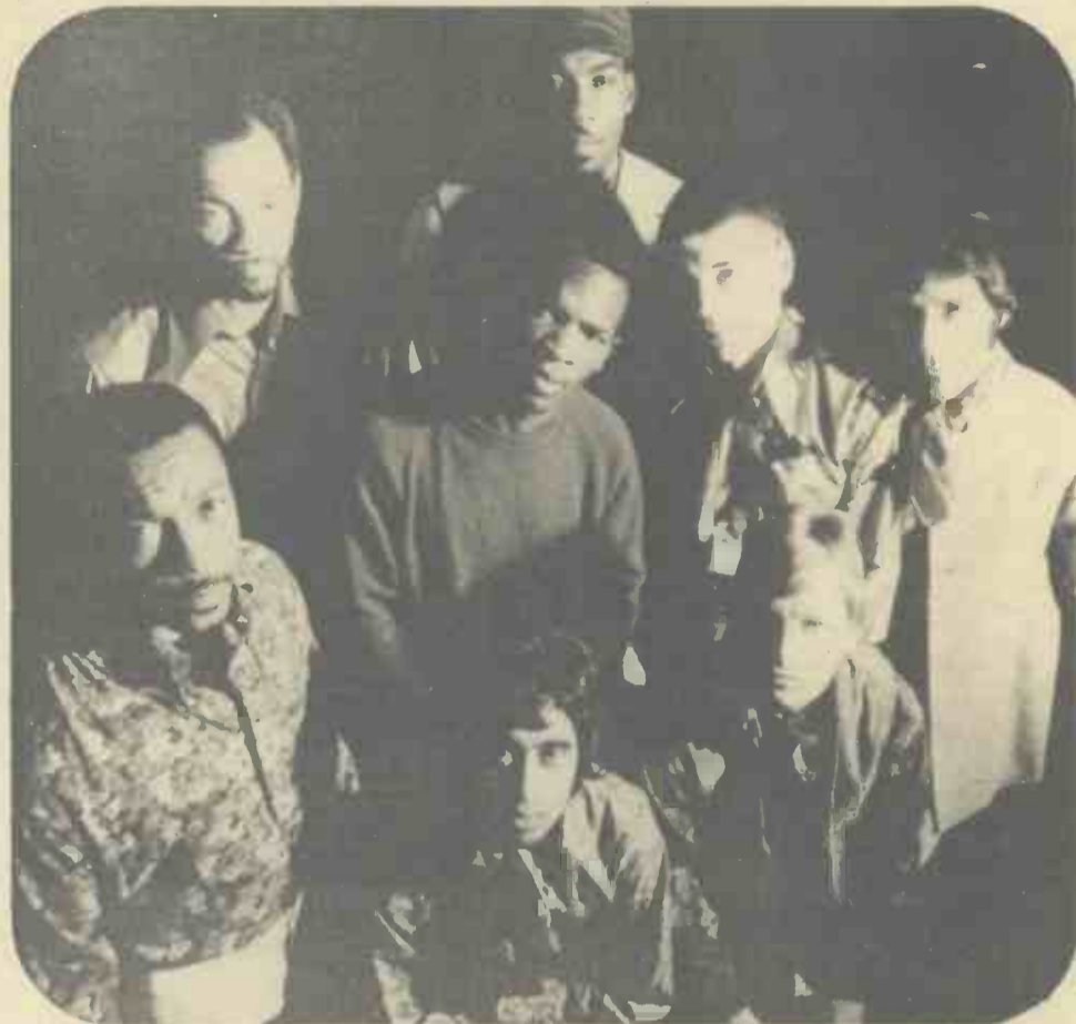
THE FOUNDATIONS — one of the few groups to get a number one hit with their first record.