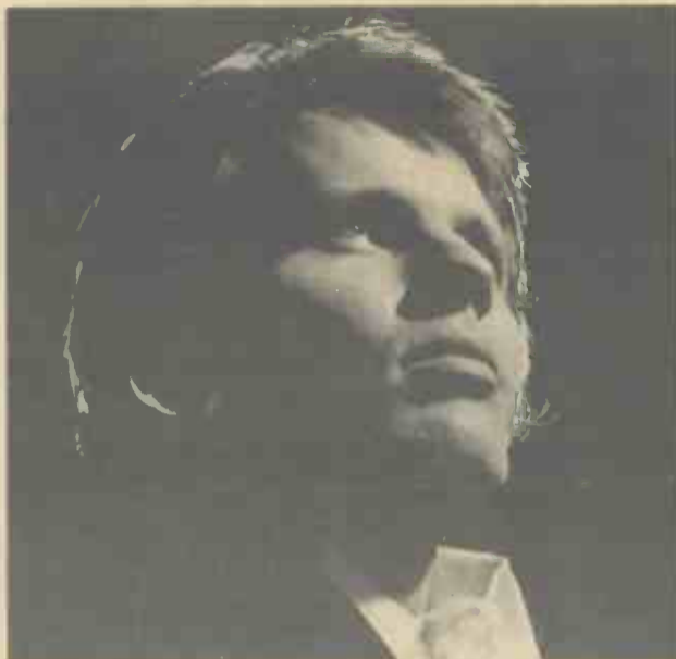
JOHN WALKER—he says some interesting things about the songs he writes and the way he writes them.

"We're a different breed than record artistes. Some people are best on records, other people are best 'live' on clubs. Fortunately, we were pretty good in the recording studio. But we are better 'live'—with our stage act we brought in new ideas and things. Even today a lot