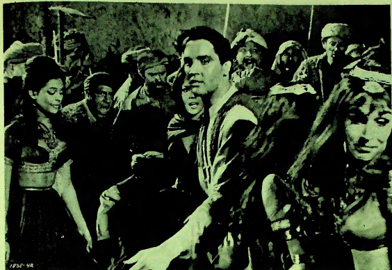
ELVIS sees once more. Another action-packed shot from a film which looks like being El's most different for a long time