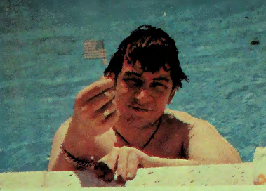
ERIC BURDON of the ANIMALS having a good time during his last trip to the States. The Animals have several tracks on the Columbia album "On the Scene" Volume Two, issued this month.