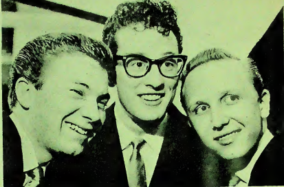
BUDDY HOLLY with his CRICKETS. On the left is Jerry Allison and on the right Joe B. Maddin. The pic was taken during Buddy's tour of Britain over seven years ago by courtesy of the Buddy Holly Appreciation Society.