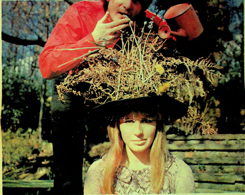
At home with John and Cynthia. It's more than unusual for John to be photographed in the privacy of his home — it's unique. Let's hope that when he sees this extremely captivating shot of his wife and himself he doesn't have any regrets.

Largest selling colour pop weekly newspaper No. 222 Week ending June 12, 1965 Every Thursday 6d. Registered at the G.P.O. as a newspaper