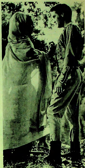
ELVIS with his romantic lead MARY ANN MOBLEY.