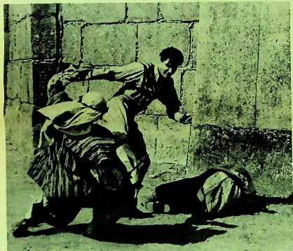
ELVIS is pursued by thugs after he refuses to help assassinate the king of a small desert country. The usual fight scene, with the usual results — a win for Elvis.

In ELVIS' new film "Harlem Holiday" he portrays a modern-day Rudolph Valentino. It's an adventure-dilled comedy, with new songs galore and co-stars Mary Ann Mobley and Fran Jeffries. Film is an MGM production and directed by Gene Nelson.